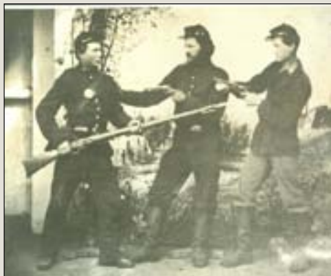
8th Illinois Members pose for a photo