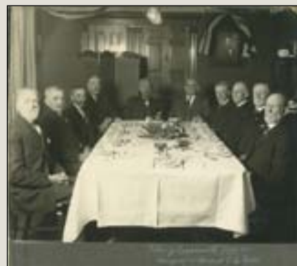
Members of the 8th Illinois at a Reunion Dinner