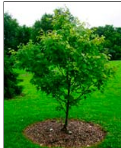
Properly mulched tree

If you have questions, contact Public Works at 630-377-4405.