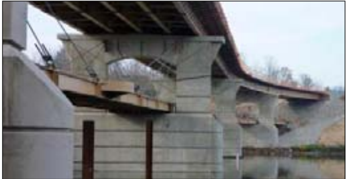
Installation of bridge cables, east side of bridge looking west

For more information and updates on the progress of the bridge, visit the project website www.redgatebridge.org . And be sure to check out the two project webcam feeds that offer real time video of project work in action.