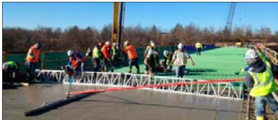
Concrete for the bridge deck was poured last month

A complete list of meetings, including Commission, Board & Task Force meetings is @ www.stcharlesil.gov/meetings