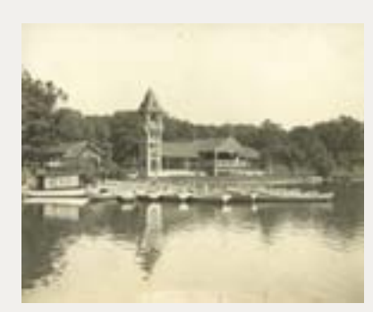
The original Pottawatomie Park Pavilion circa 1900

It's summertime in St. Charles. Time to get out and enjoy the beautiful parks, relaxing riverwalk and miles of trails throughout the city.