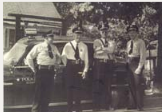
Members of the St. Charles PD, circa 1950