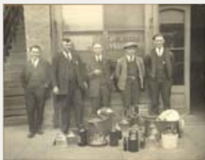
St. Charles Police Officers after raiding an illegal still, circa 1920

In the 1920s, St. Charles police protection included two officers working 12-hour days, 7 days-a-week. Things have changed a bit through the years. Take a look.