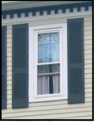
Shutters that are too tall, or alternately, too short, for the window opening.