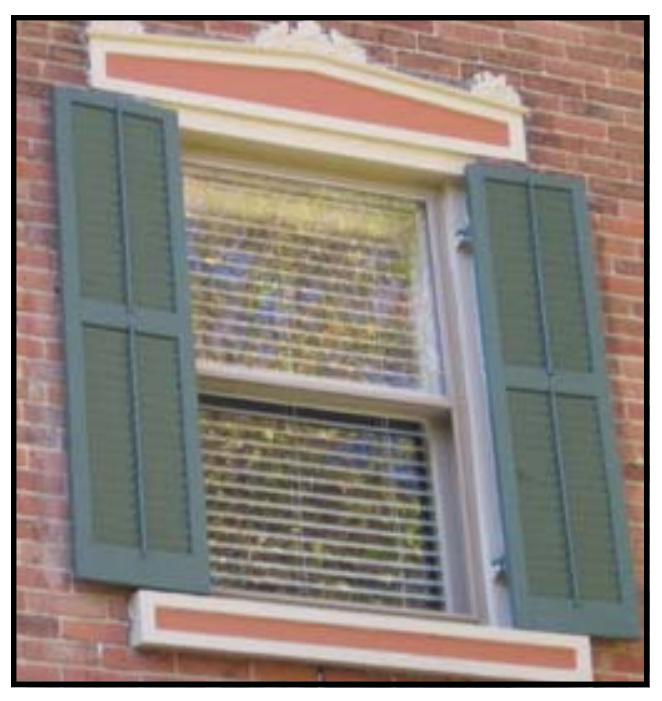
Appropriate historic shutters. Each shutter is 1/2 of the window opening and the original hardware is attached to the window frame.