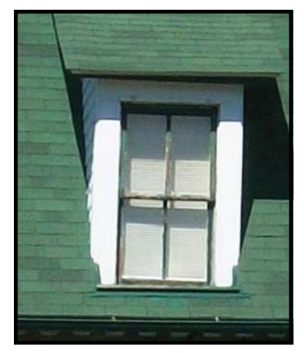
2 over 2 lights in a shed dormer