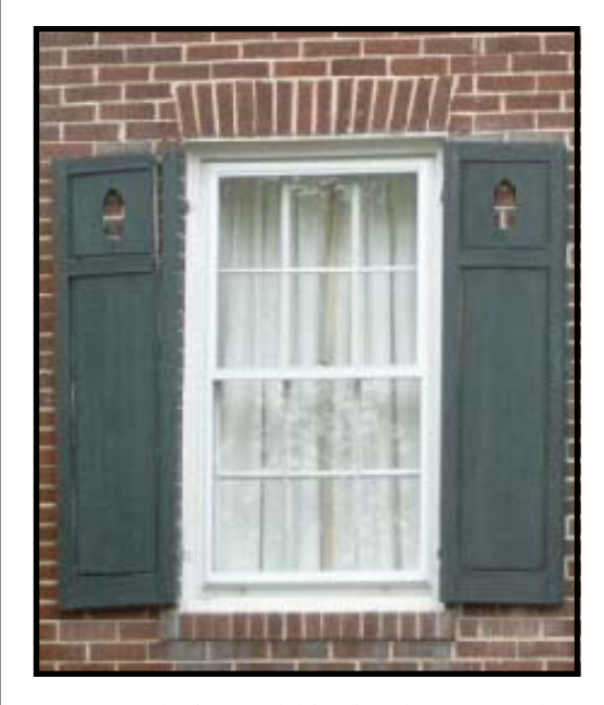
Cut-out designs within the shutter can be original, but it is important to stay consistent if replacements are needed.