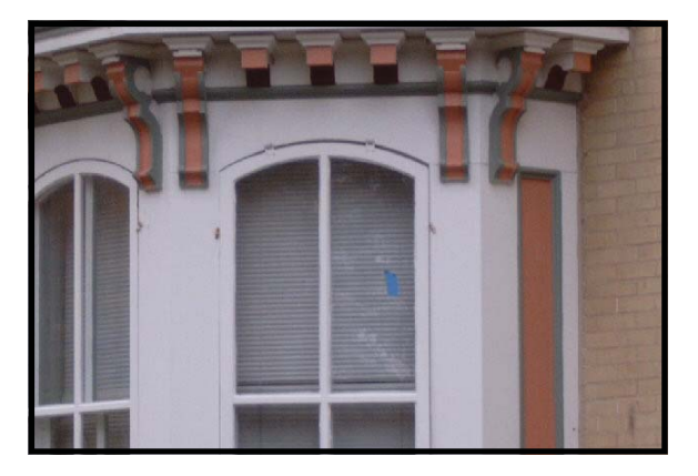
Arched-top storm window matched to the window.