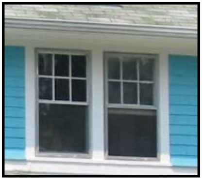
Double 6-over-1 lights