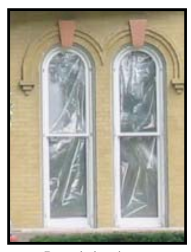
Rounded arch top 1-over-1 lights