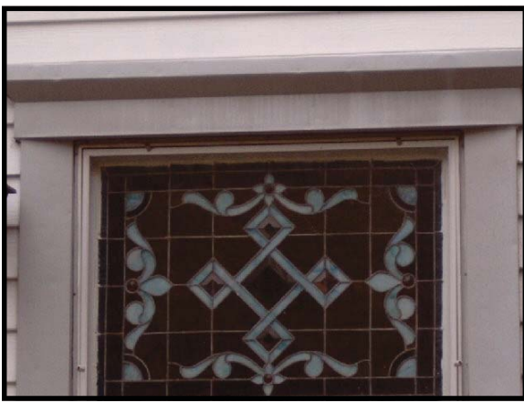
It is not unusual for a house to have more than one decorative window. Each may have its own unique design or pattern.