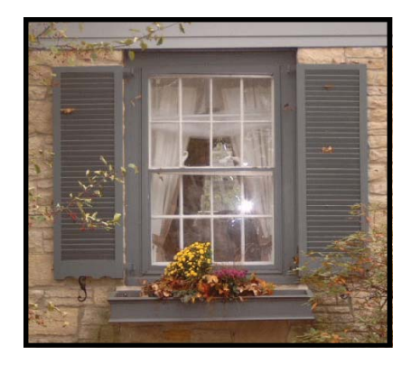
8-over-8 lights with shutters