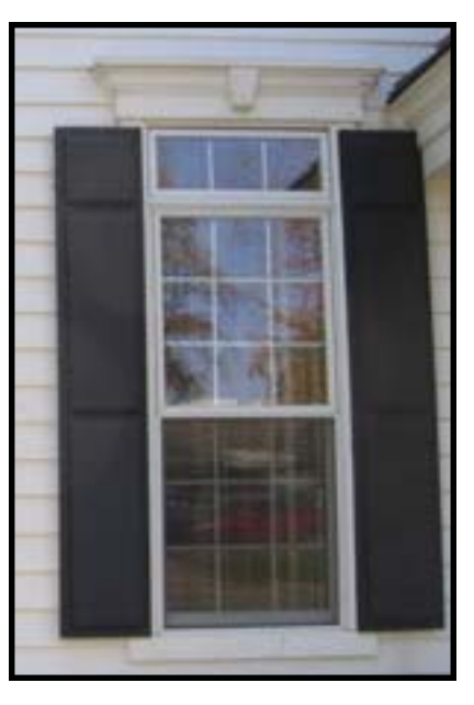
Three-panel shutters matched to the window configuration and attached over the casing.