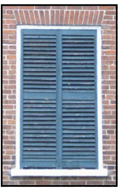
Shutters used when a window is removed or to add a false window for symmetry.