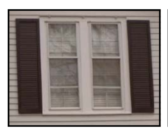
Shutters used with multiple window units are out of proportion. For aesthetic appeal, appropriate sized casing can be used around the windows.