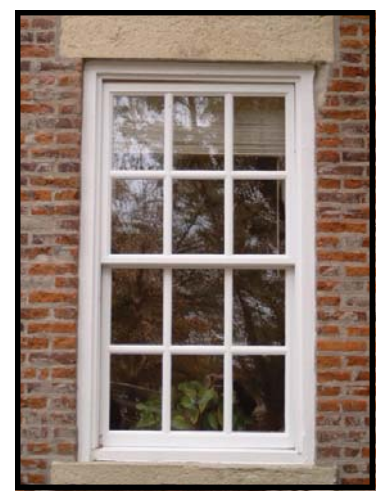
6-over-6 lights with stone lintel and sill