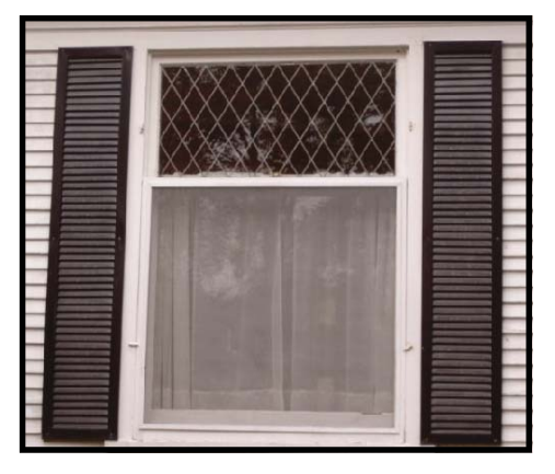
Shutters were not typically installed on fixed picture windows. If installed, each shutter should be 1/2 of the window opening size.