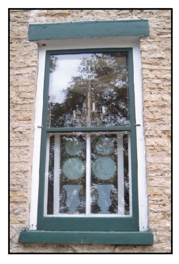
Wood storm window with a central meeting rail matching the window.