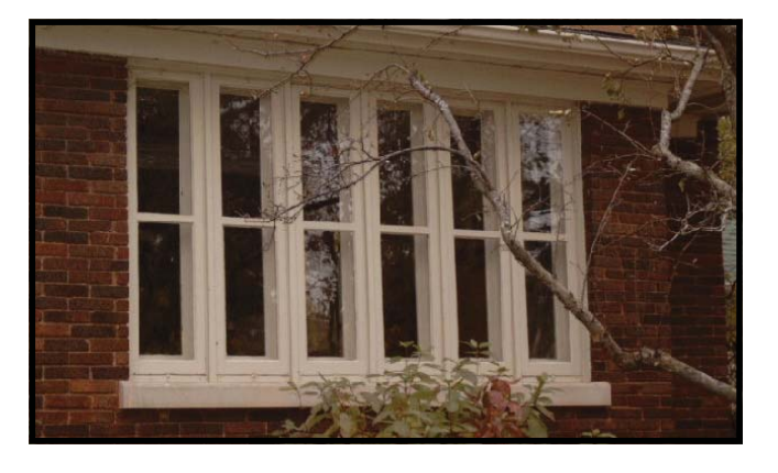
Appropriate wood storm on a casement window.