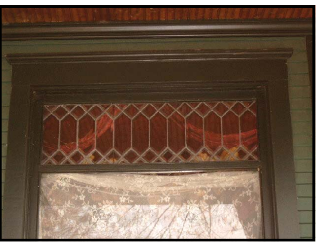
Decorative glass windows are commonly found in transoms above entry doors or in a transom panel above a picture window.