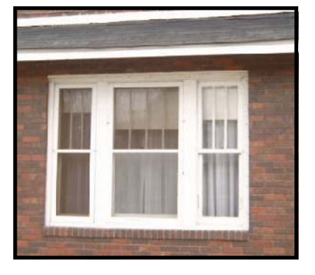
4-over-1 lights flanked by 3-over-1