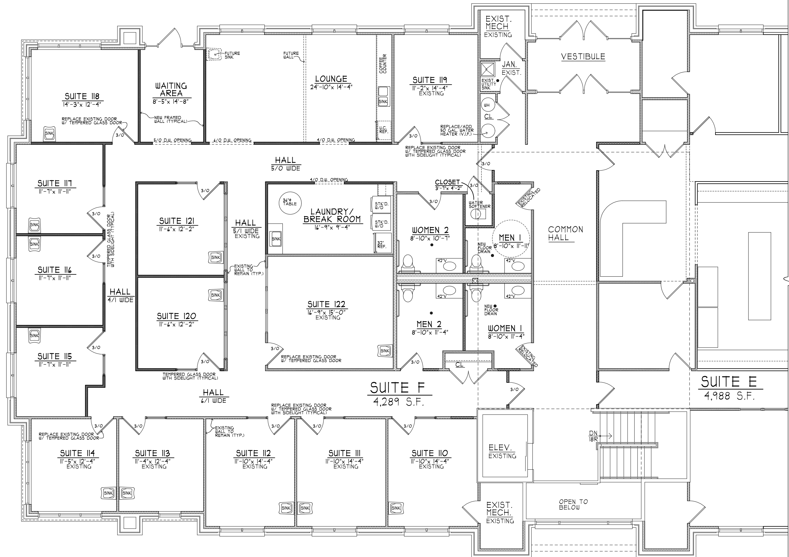
FLOOR PLAN SCALE: 1/8" = 1'-0"