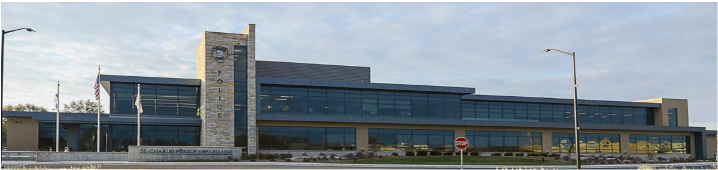
The St. Charles Police Department is located at 1515 W. Main St.