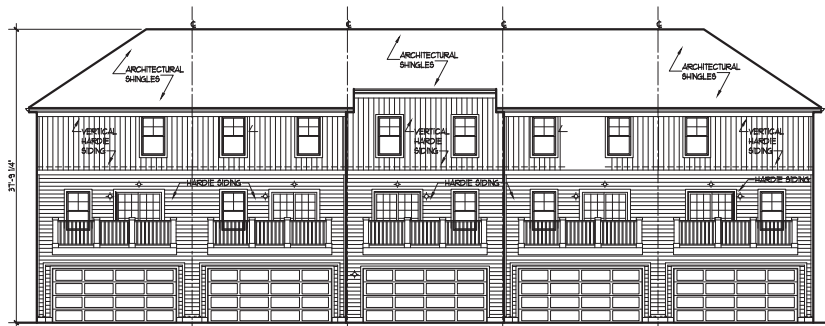
TYPICAL REAR ELEVATION