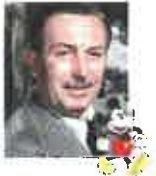
May 13: Walt Disney (cartooning)