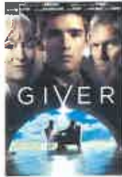
April 5: The Giver