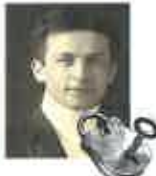
April 8: Harry Houdini (magic tricks)