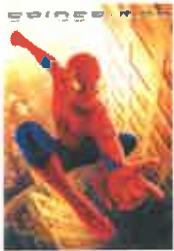
March 1: Spider-Man (2002)