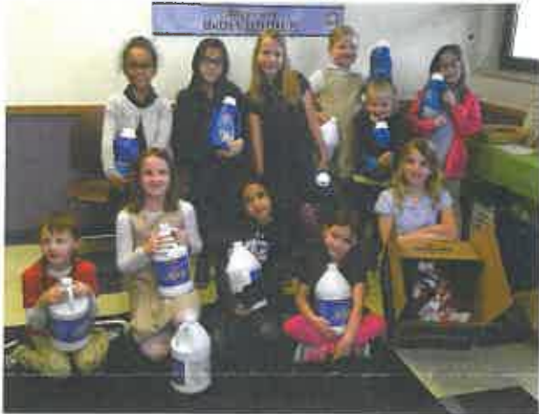
Troop 1009 with supplies they delivered.

Many Girl Scouts love helping animals! Troops 1009 and 2199 recently completed service projects benefitting local animal shelters. Each troop is fortunate to have caring, adult leaders who provide guidance but also encourage girls to decide what they want to do for their community service. Both troops participated in brainstorming sessions on how to best use their troop's proceeds from the Girl Scout Cookie Program to help others.