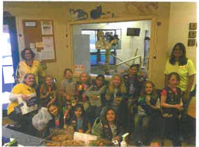
Troop 2199 with Helping Paws volunteers

Girl Scout Brownie Troop 2199 had just completed a service project prior to Girl Scout Cookie season. The girls made fleece scarves and purchased slippers for holiday gifts. They gave the items to residents of St. Anne's nursing home in Rockford who didn't have family nearby for holiday celebrations. After Girl Scout Cookie season, the girls discussed how they wanted to use their proceeds from the cookie program. They decided they wanted to go to LEGOLAND, and they wanted to help animals! The girls chose to help Winnebago County Animal Shelter, thinking the shelter might not get as much support as some of the others animal shelters in the Rockford area. They made a list of what they wanted to purchase for the shelter and donated specialty laundry soap, bleach, toys, and food bowls. They delivered the items and enjoyed a tour of facility!