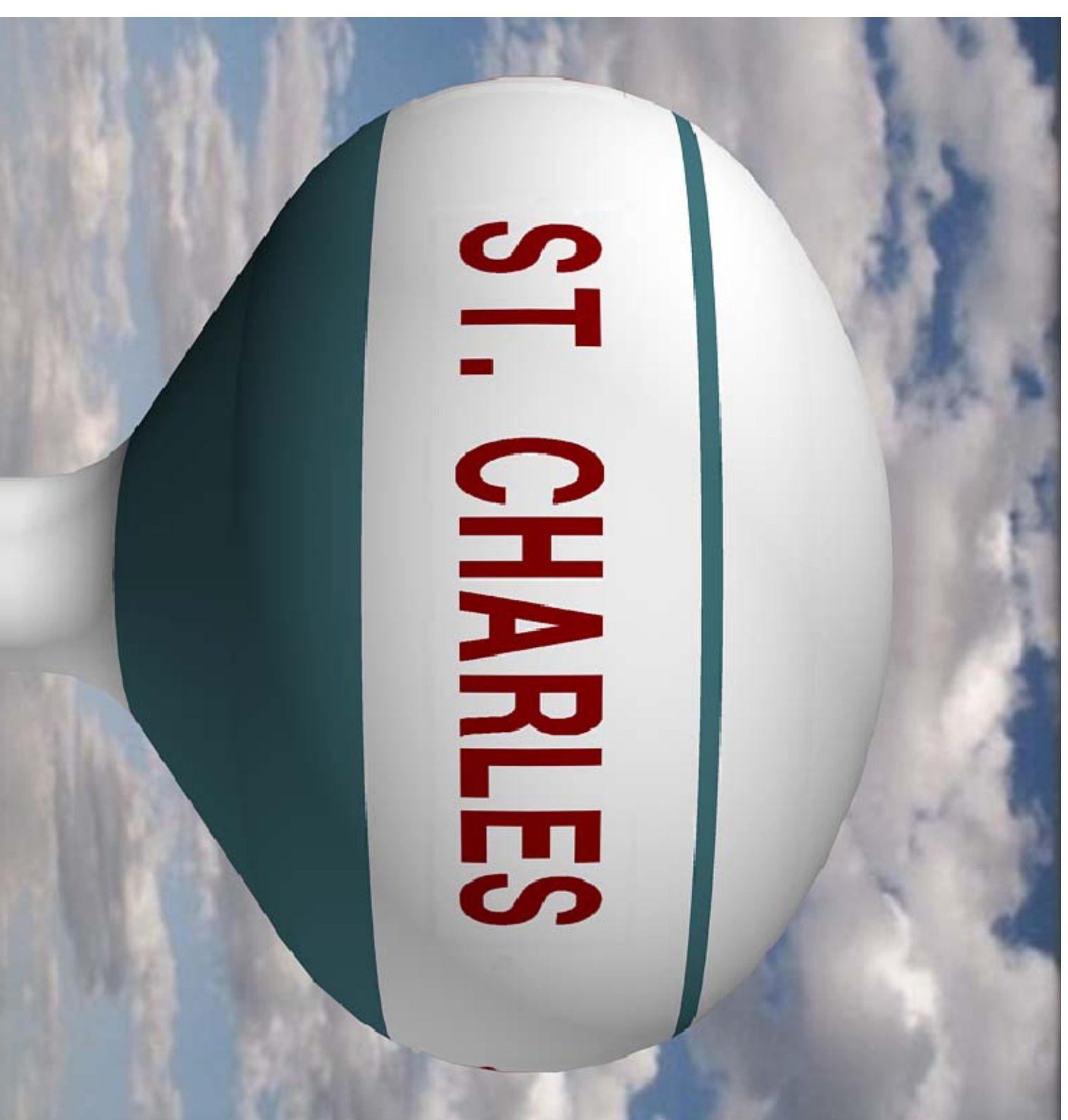
NORTH - SOUTH

NOTE: ALL DIMENSIONS ARE APPROXIMATE AND WILL BE CONFIRMED BY THE PAINT CONTRACTOR AT SHOP DRAWING SUBMITTAL