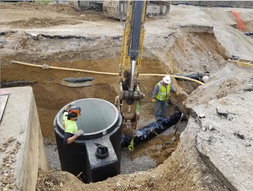
Sewer Piping & Manhole Install