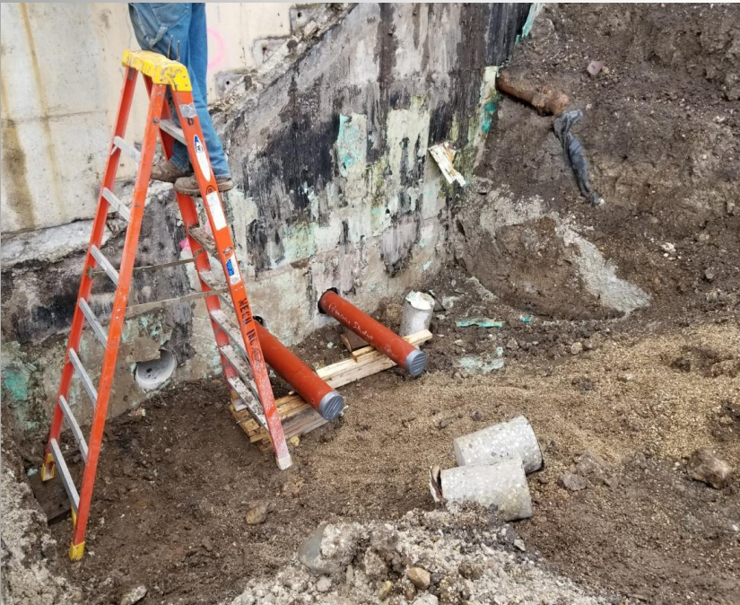
Pipe Wall Penetrations