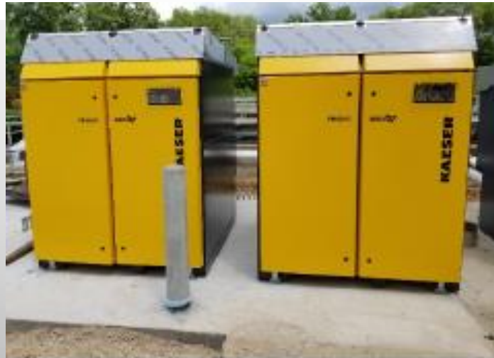
New Positive Displacement Blowers (B-1404 and B-1405) Placed on Equipment Pad