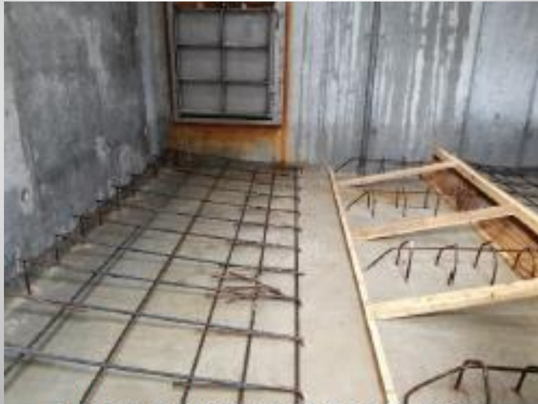
Rebar for IR Pump Station Topping