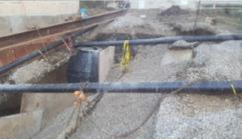
Excavation for Primary Sludge/TWAS Piping and Sanitary Manhole #2