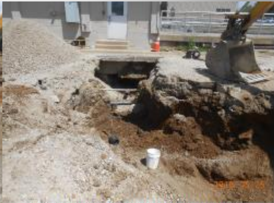
Excavation for Primary Sludge Pipe Connection to the Grit Building