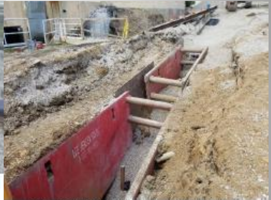
Excavation for Digester Drain Pipes