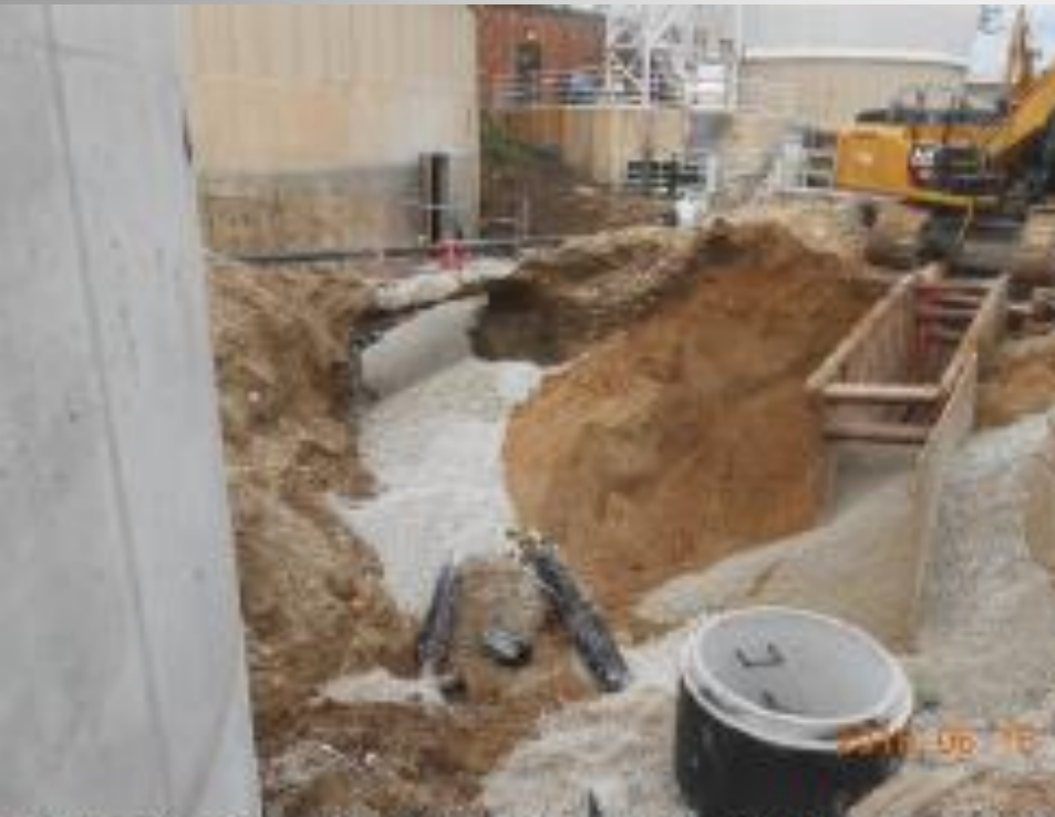
Digester Drain Pipes to Sanitary Manhole #1