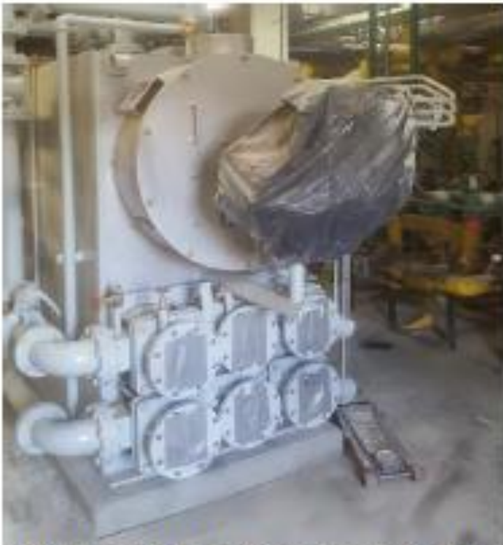
South Boiler/Heat Exchanger in Place