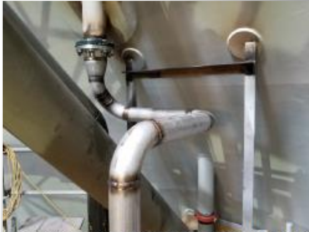
Digester Gas Pipe Connection in South ESAD