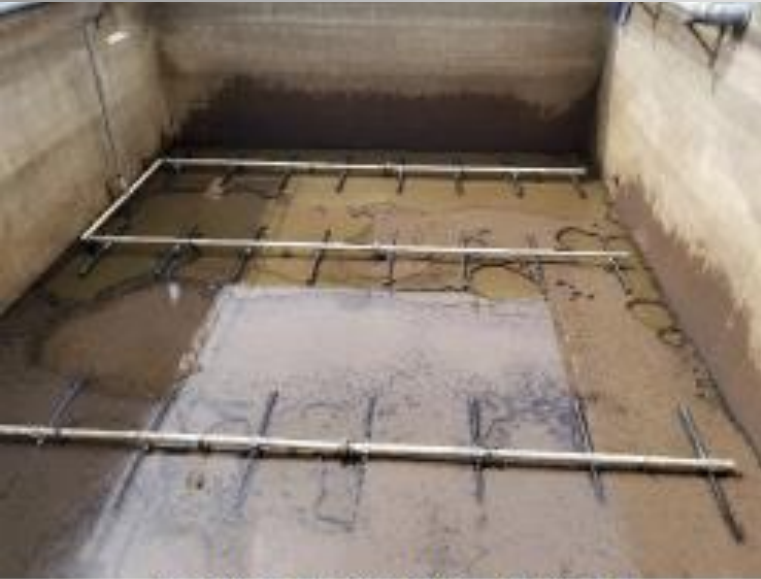
Aeration Basin 1401, Drained