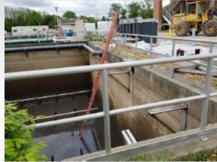
Stainless Steel Air Header Pipe Supports in 1400 Basins