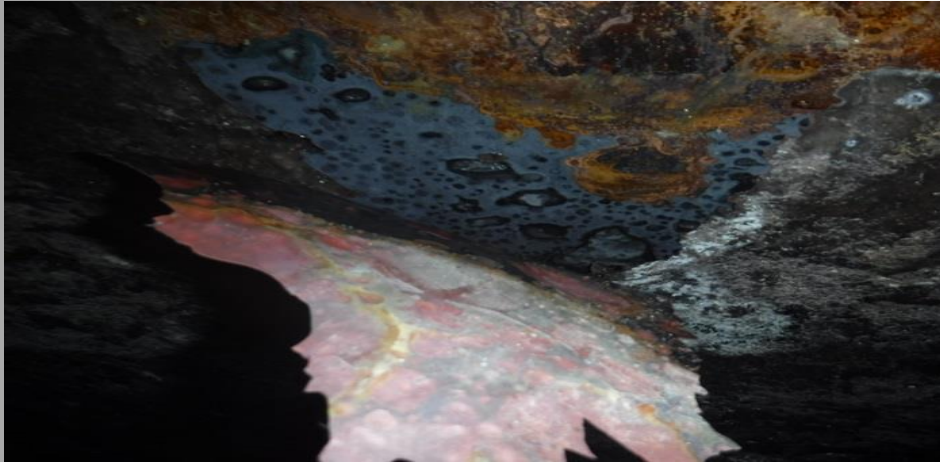
Coating Delamination and Failure