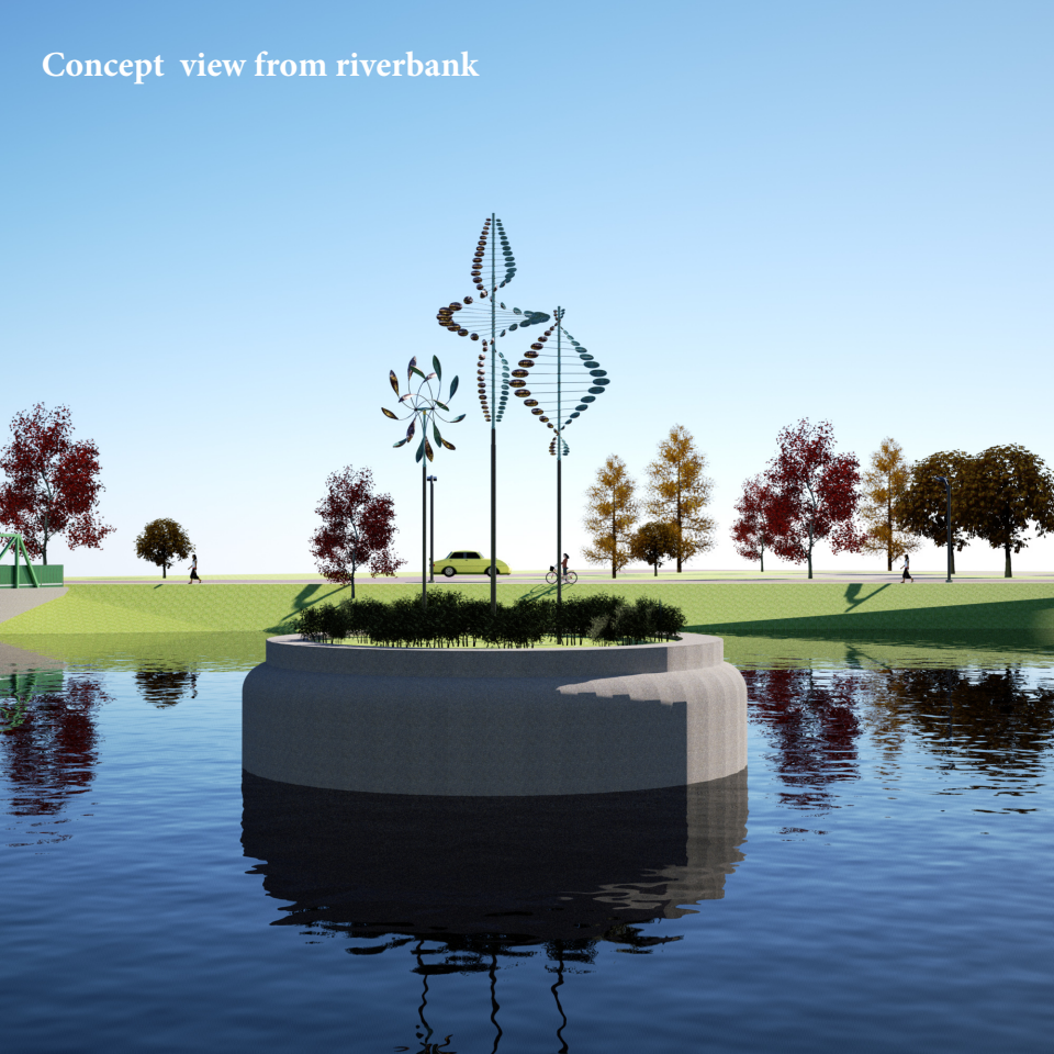
Concept view from riverbank