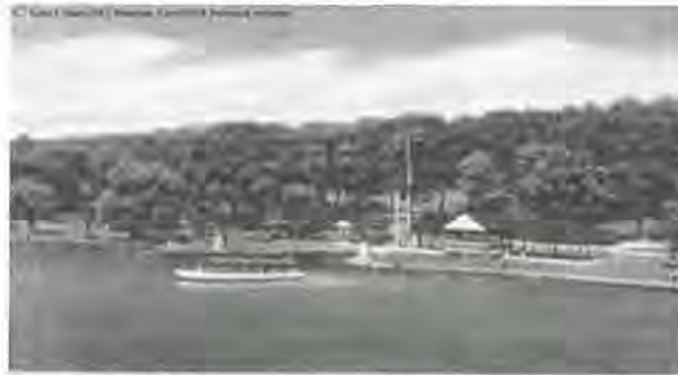
Beautiful Pottawatomie Park — St. Charles, Ill