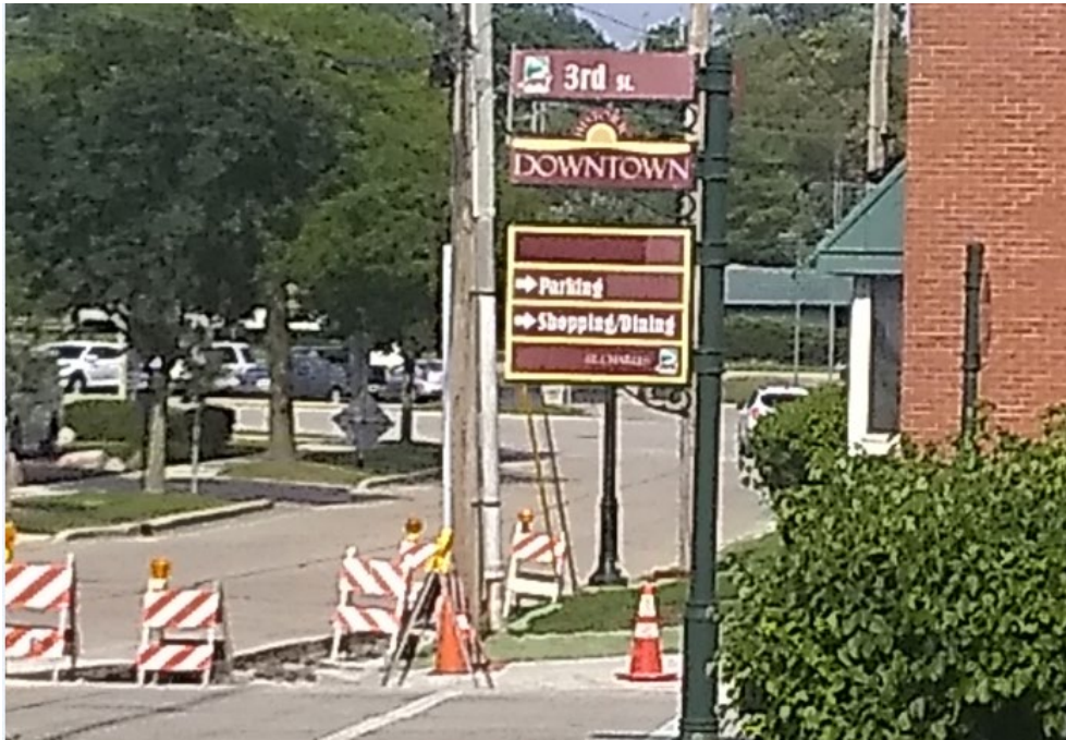
Figure 5: Unclear Wayfinding Signage