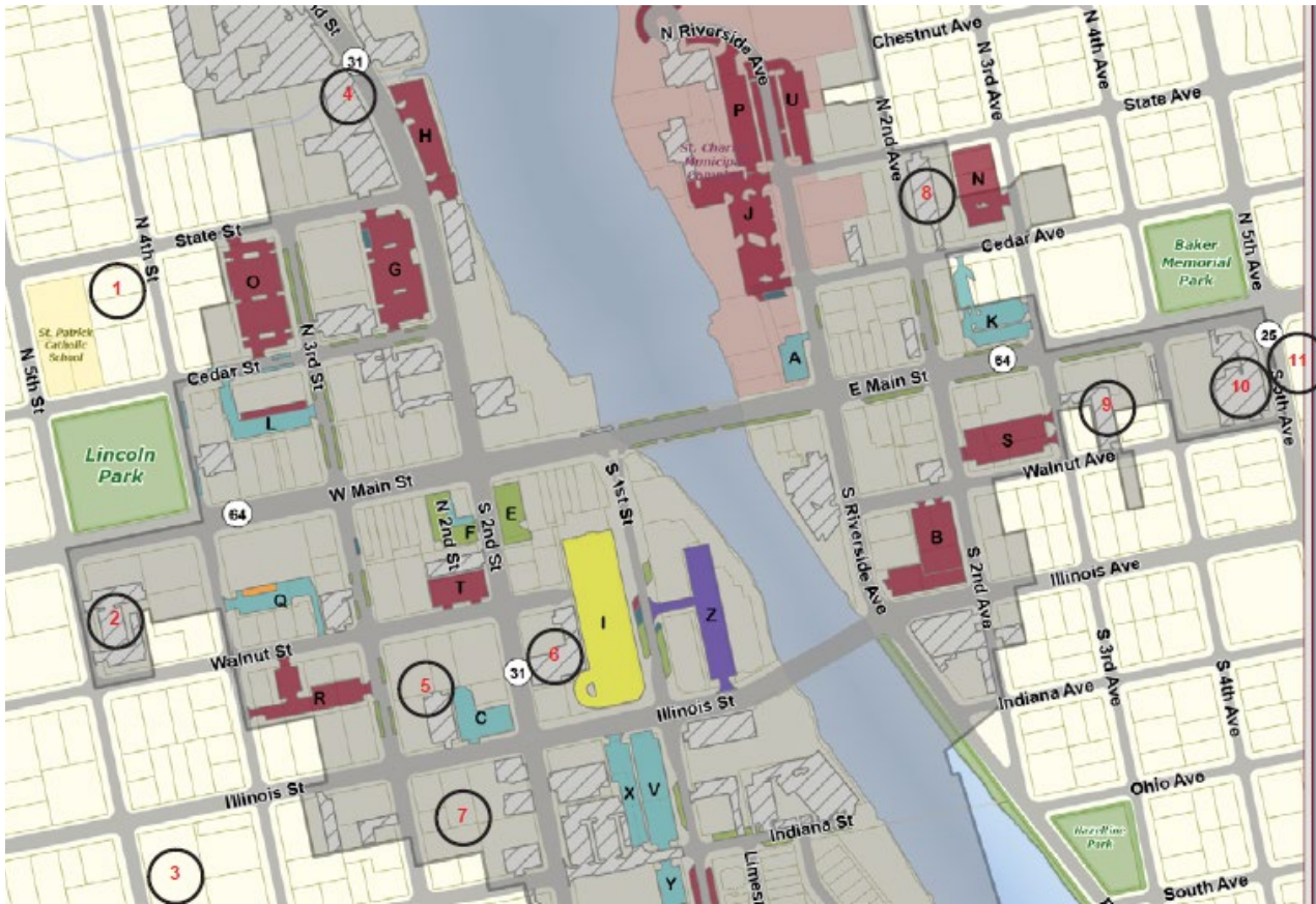
Figure 10: Candidate Shared Parking Locations