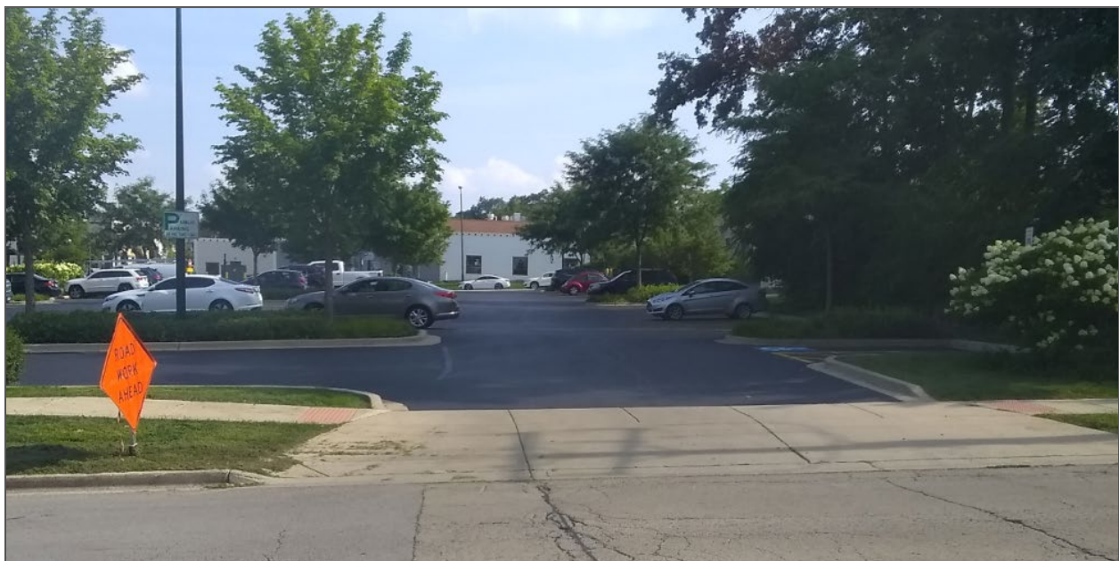
Figure 6: Small Sign Size, Suboptimal Location, and Unclear Meaning