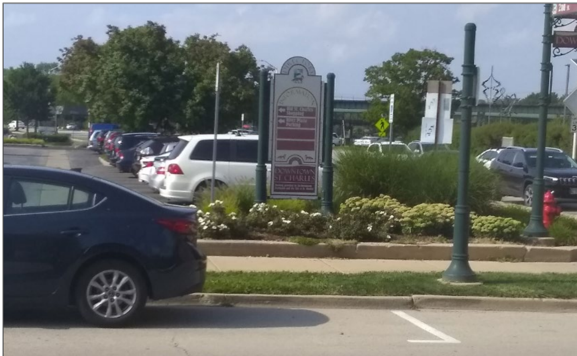
Figure 4: No Clear Indication of Public Parking at Lot Entrance

Wayfinding and signage in the surface lots are also insufficient. Signs in a number of lots are not placed in easily visible locations, do not contain easy-to-understand information, and are hard to discern whether or not the lot is public or private. A sample of currently used signage and their potential drawbacks are below in Figures 4 to 7 . Figure 4 is a wayfinding sign, but does not clearly indicate that public parking is available in the lot directly behind the sign. Figure 5 is also a wayfinding sign, but it is not specific enough. There are four public parking surface lots in the direct vicinity of the sign, and the public would be better served if the signs were positioned clearly in each of the lot's entrances. Figures 6 and 7 are examples of signage that is too difficult to see. The sign in Figure 6 is too small and far from the road, and the sign in Figure 7 is emblematic of signs in the parking garage that should be made more visible.