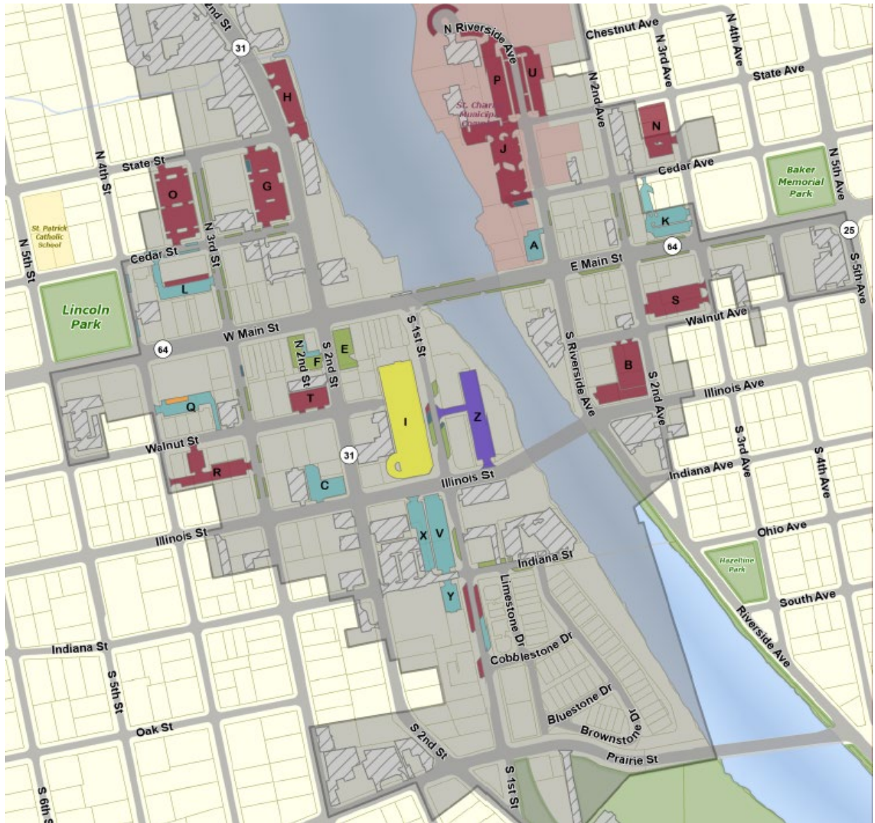
Figure 1: Study Area