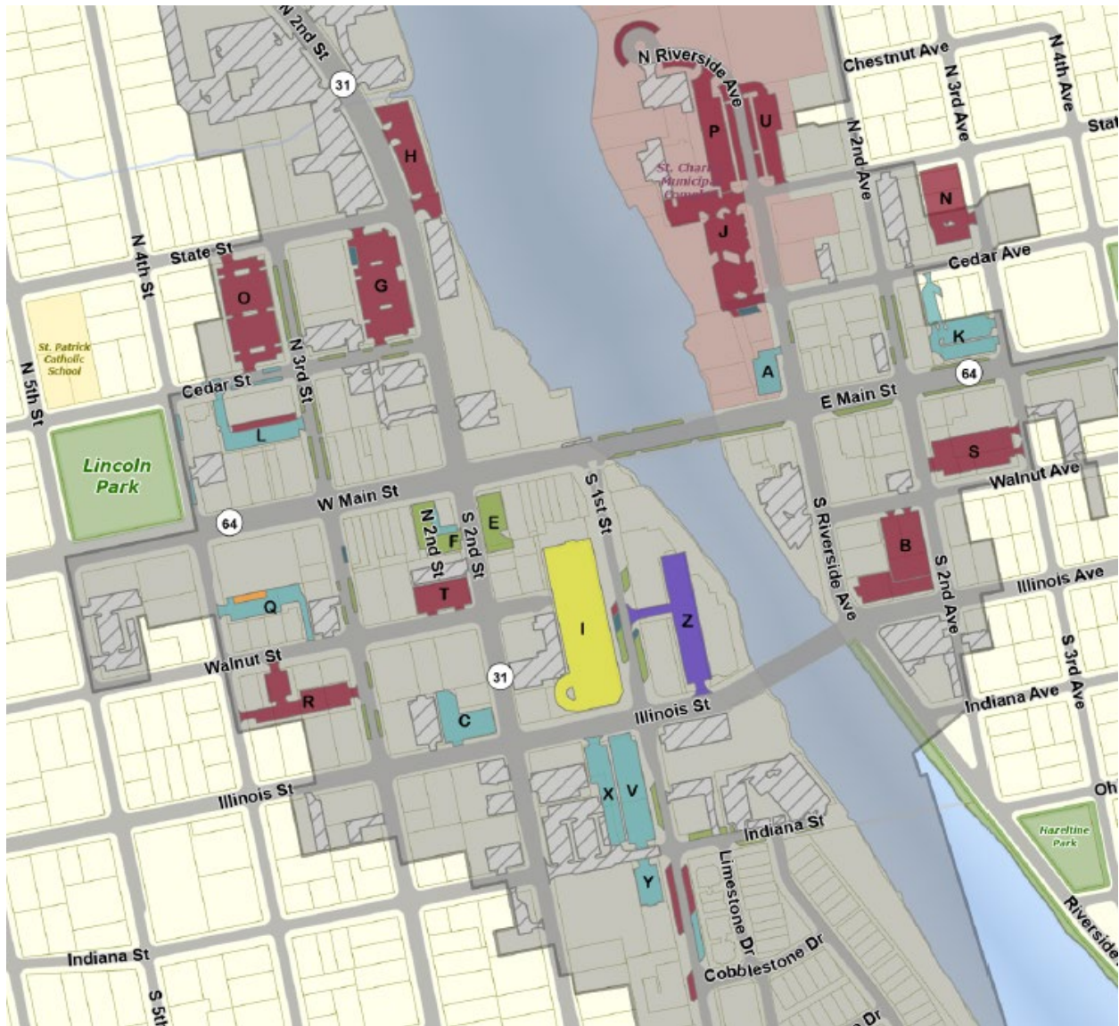
Figure 3: Off Street Parking in Downtown St. Charles According to Time Restrictions