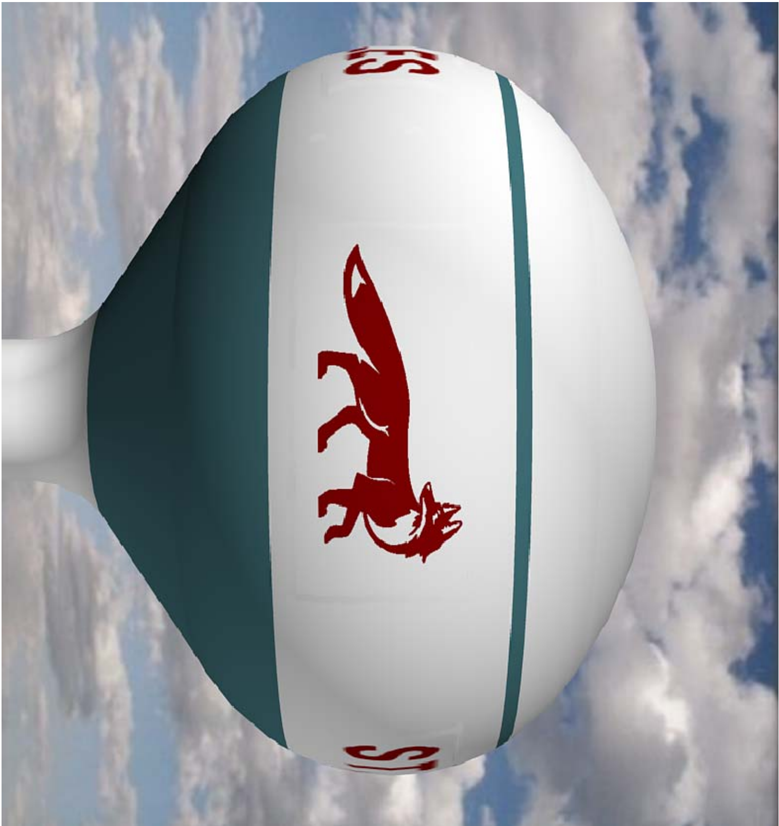
EAST - WEST