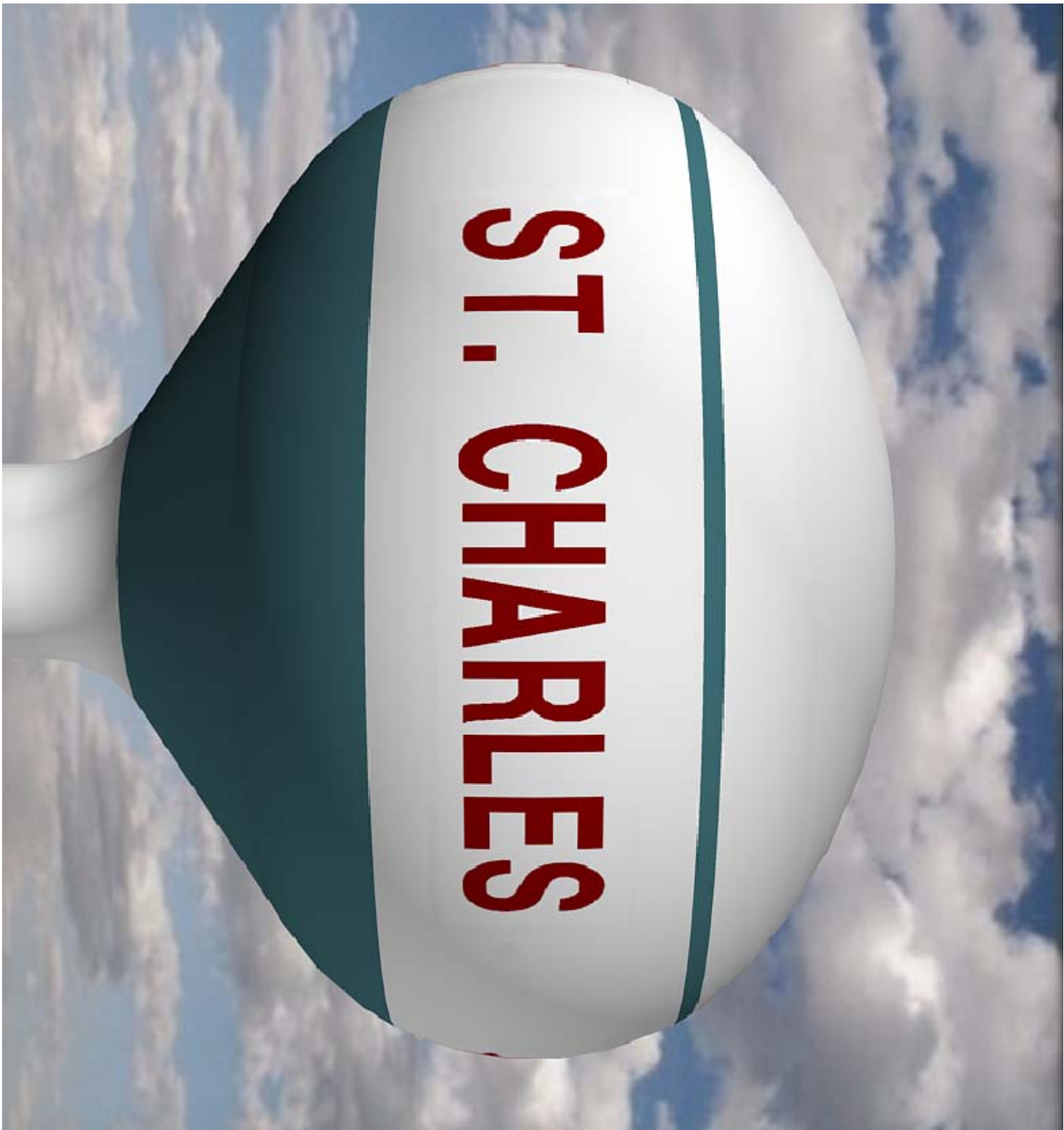
NORTH - SOUTH

NOTE: ALL DIMENSIONS ARE APPROXIMATE AND WILL BE CONFIRMED BY THE PAINT CONTRACTOR AT SHOP DRAWING SUBMITTAL