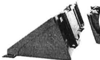
BUCKET-GP, BOCE 66"