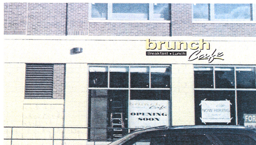
Proposed South Wall