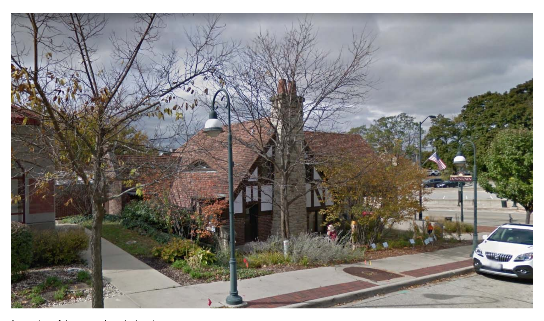
Street view of the east and south elevations