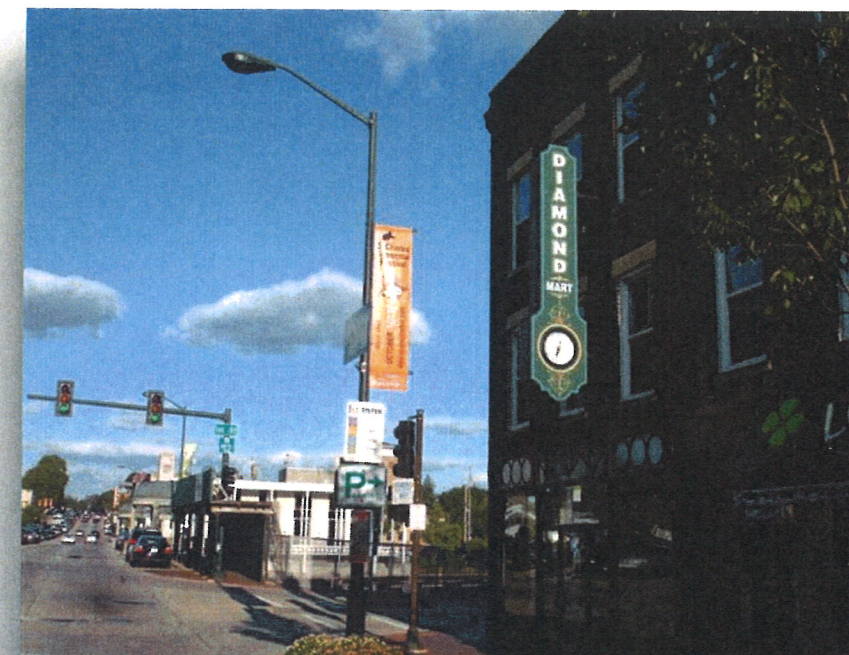
D/F ILLUMINATED DISPLAY 1/2" = 1'-0"