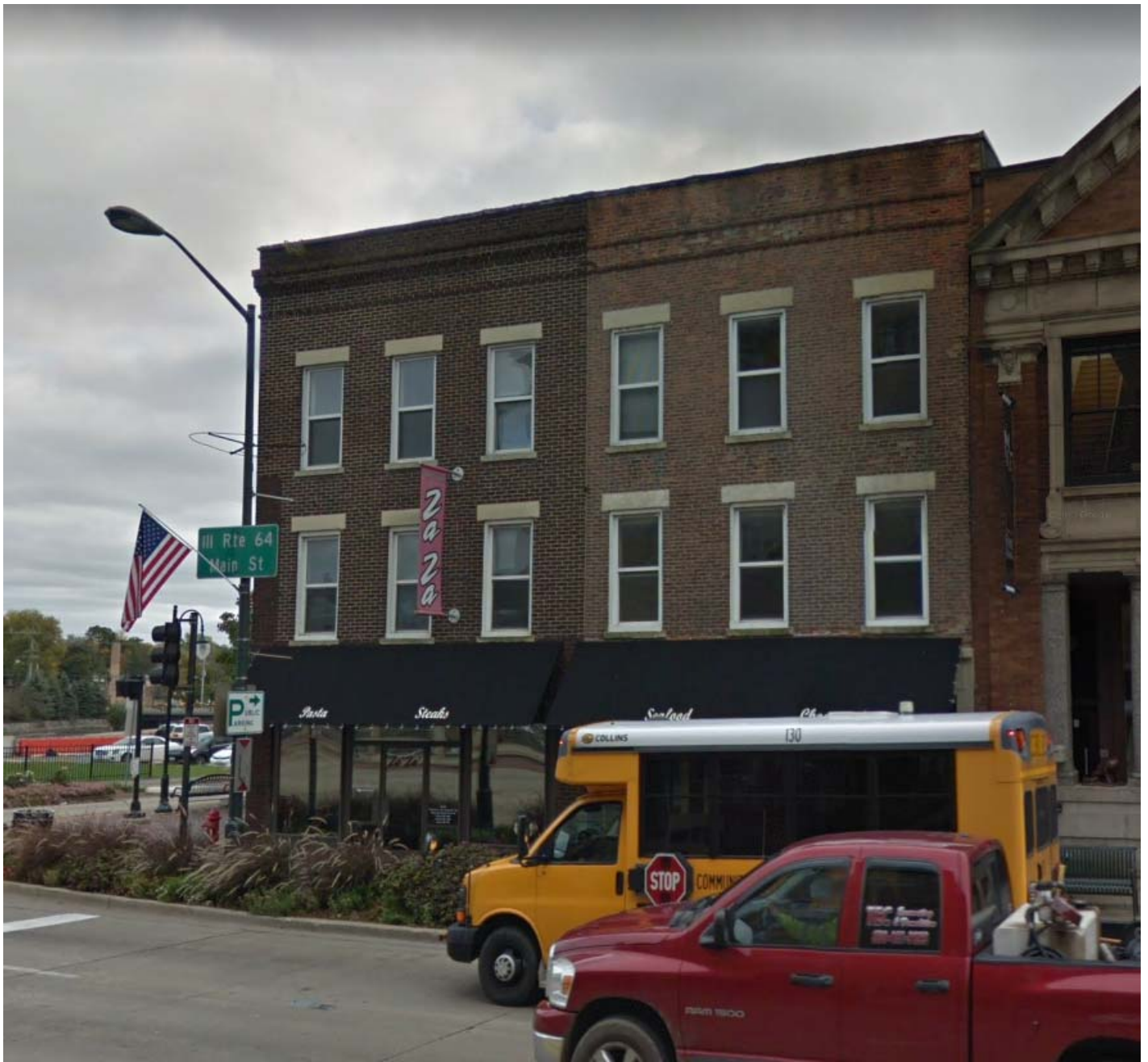
Photo showing existing projecting banner sign to be replaced.