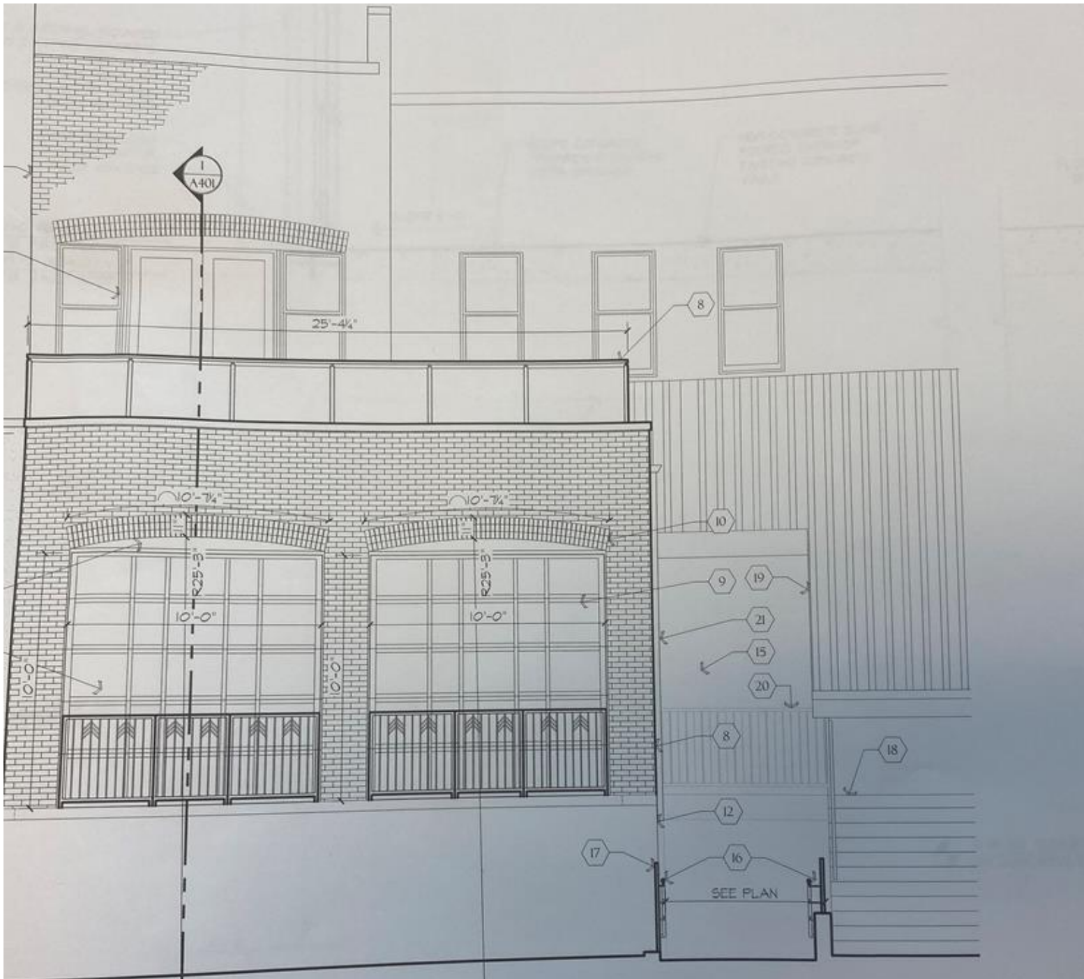
3 SOUTH ELEVATION SCALE: 1/4"=1'-0"