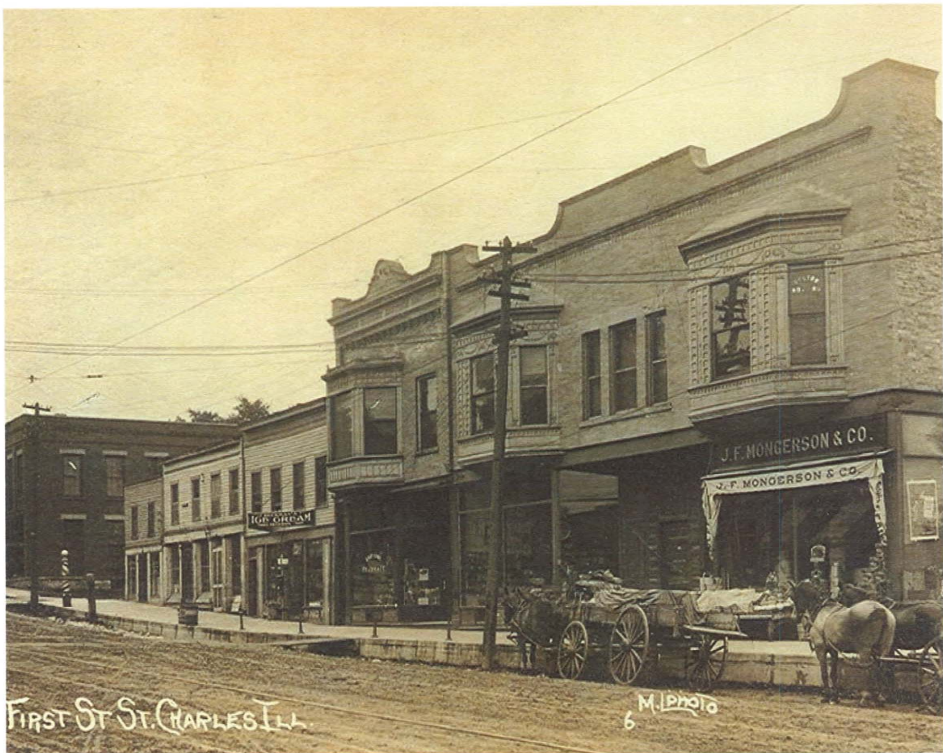
FIRST ST. ST. CHARLES ILL.