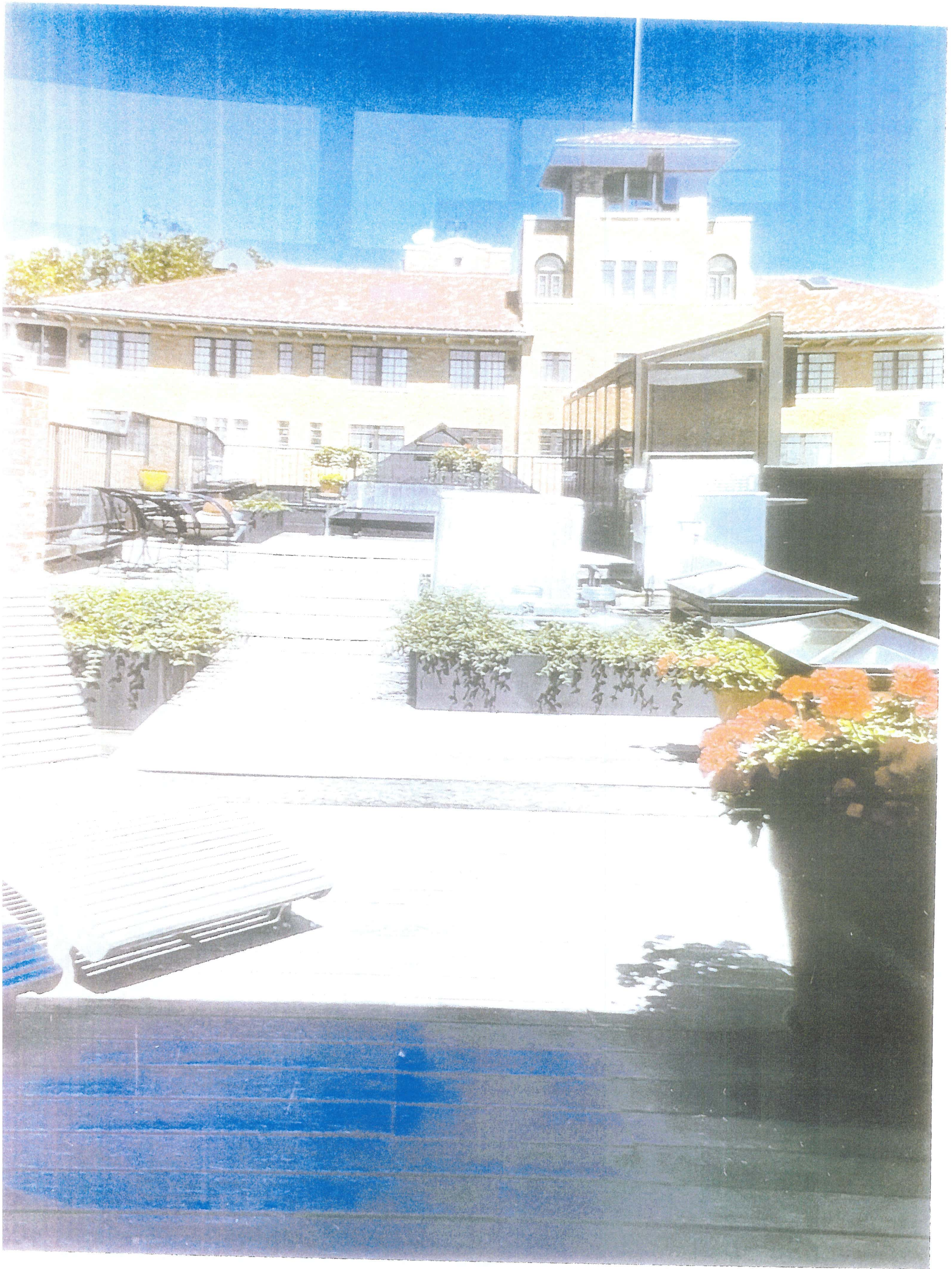
Existing Rooftop 107 W MAIN ST.