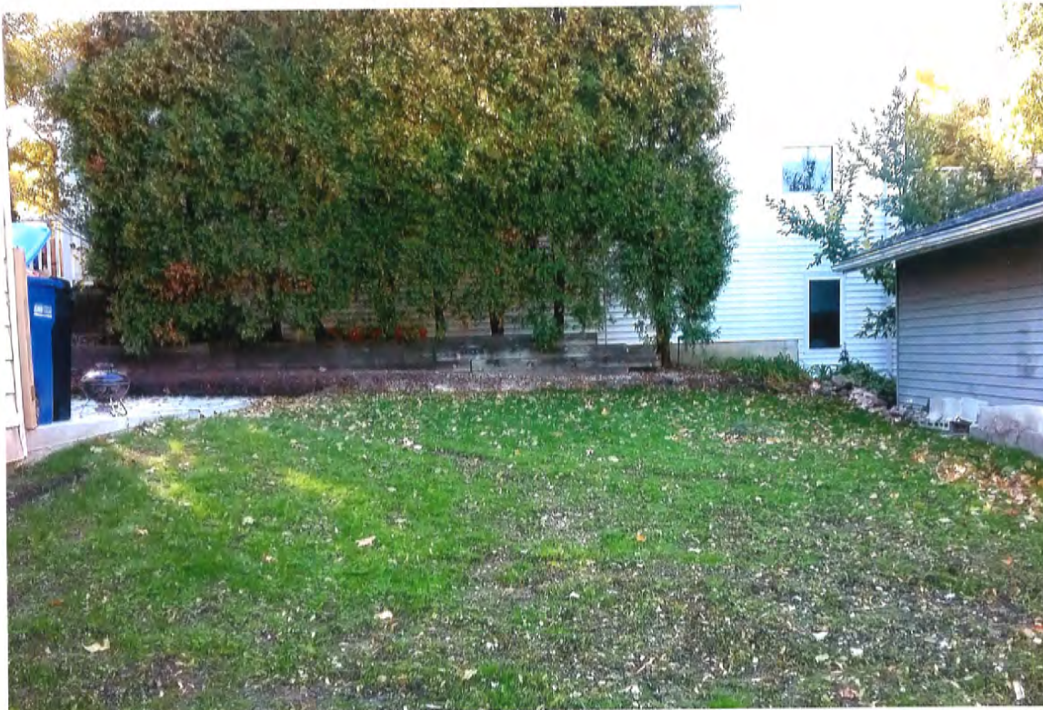
View from South 4th St.