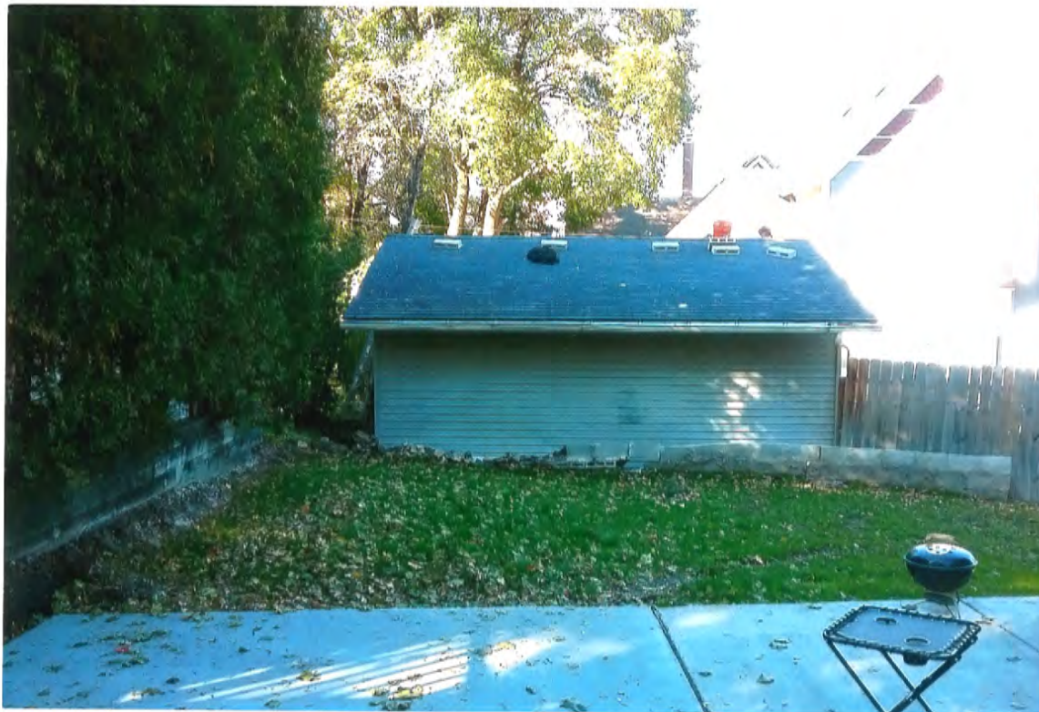
View from Illinois St.