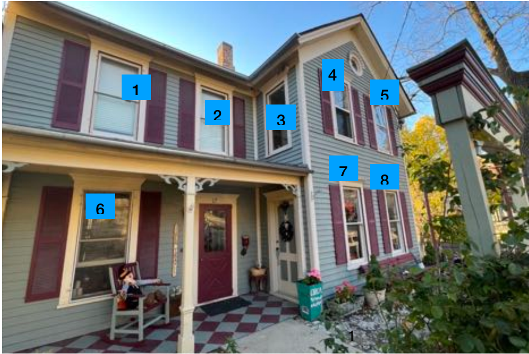
East Side Windows