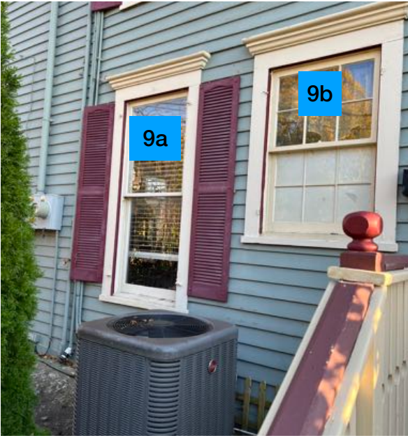
North Side (Cedar St)