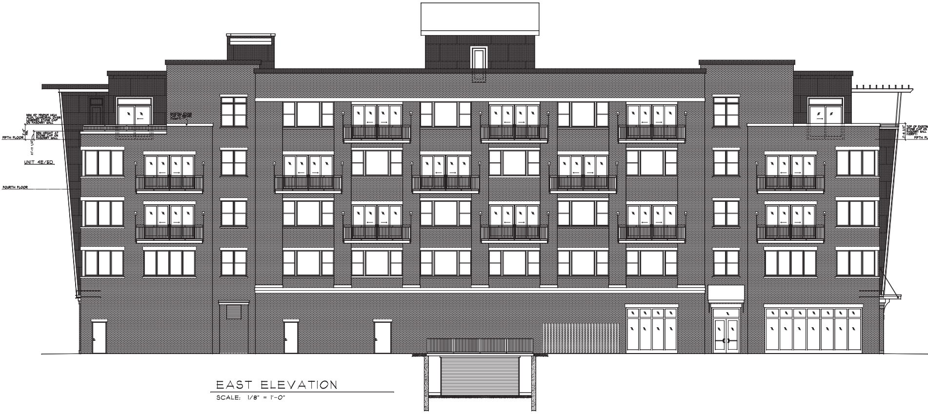
EAST ELEVATION SCALE: 1/8" = 1'-0"