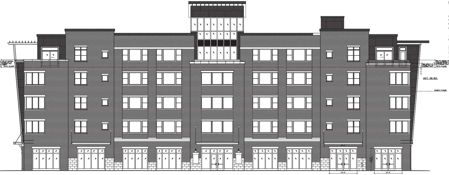
WEST ELEVATION SCALE: 1/8" = 1'-0"