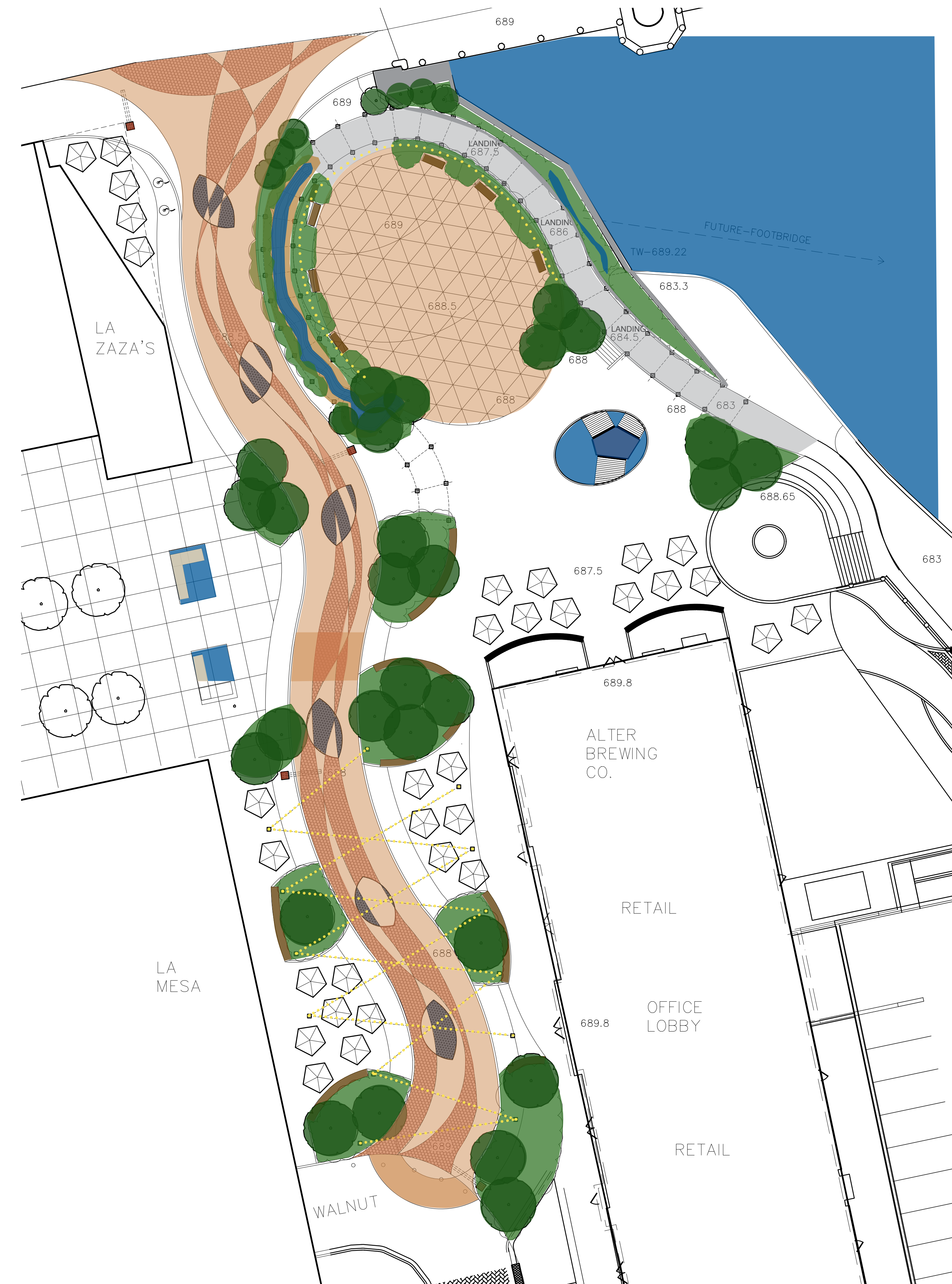
Future Plaza Expansion

• First Street between the plaza and Walnut becomes a festive walk with outdoor seating, playful lighting canopy, and special planter/sculpture gardens.