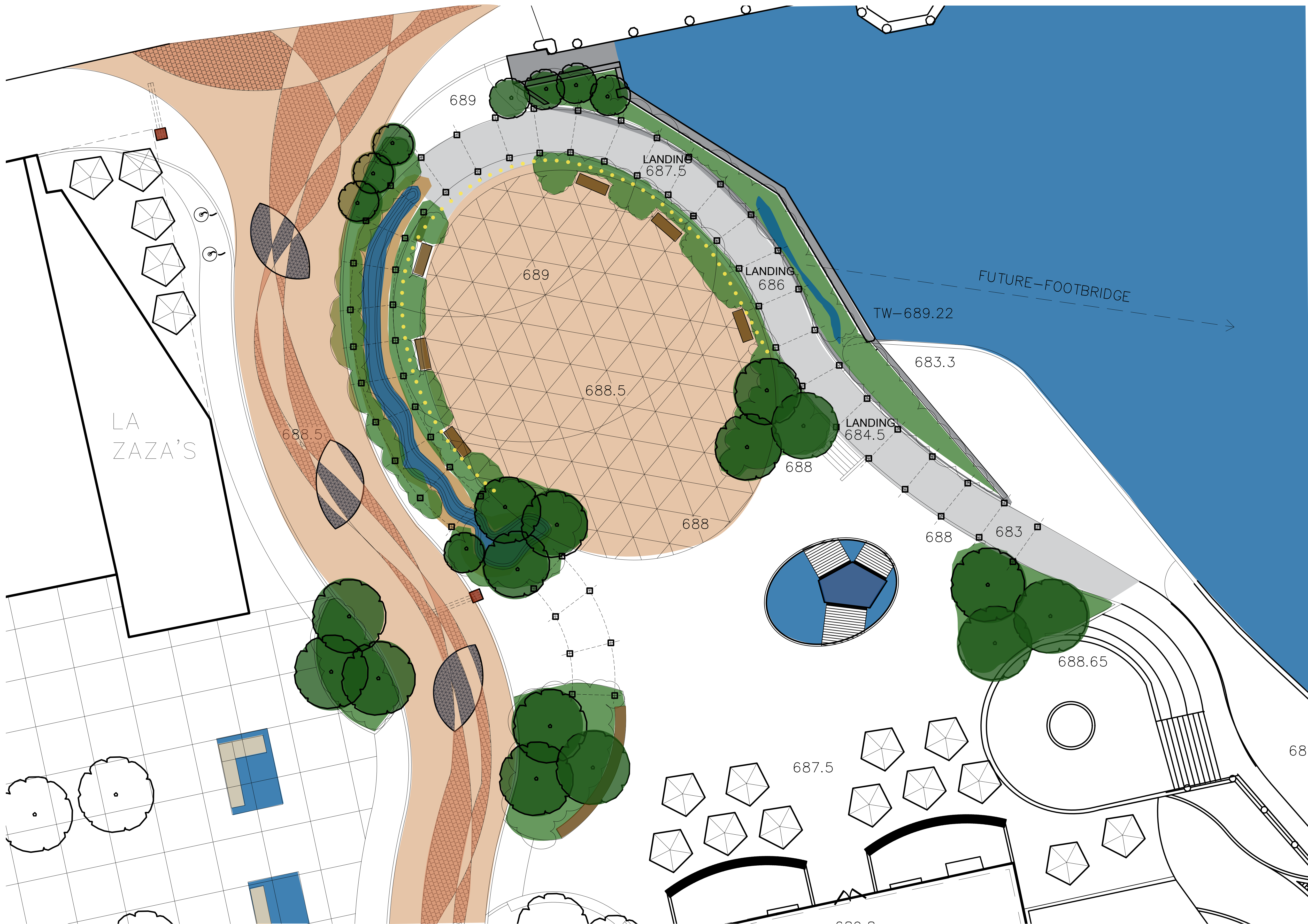
Partial Plan - North