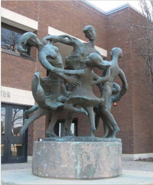
Dancing Family , Milton Elting Hebard Norris Cultural Arts Center