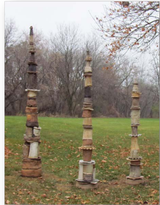
Touchstone Trio , Fine Line Potters Fine Line Creative Arts Center