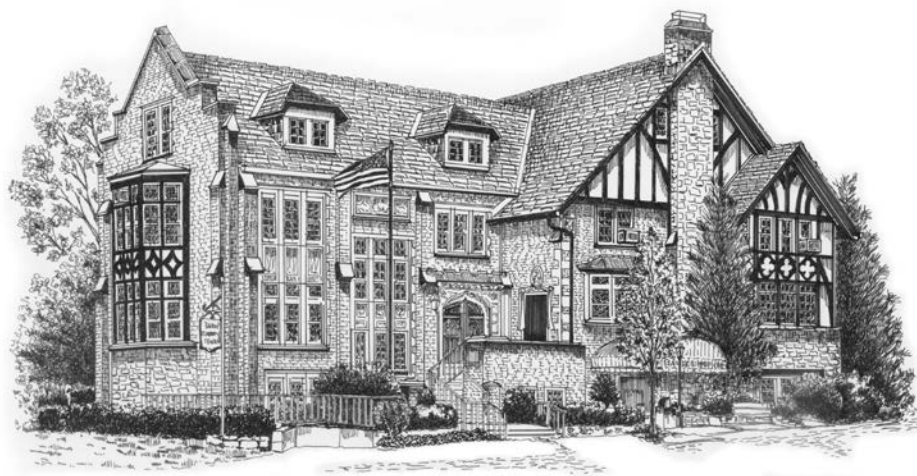
Baker Community Center St. Charles, Illinois