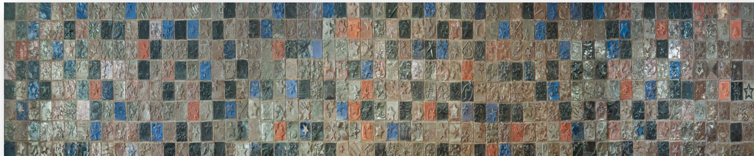
North Stars , Student Mosaic – St. Charles North High School