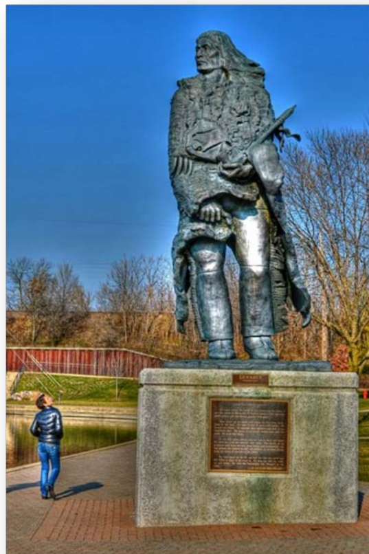
Ēkwabet (Watching Over) , Guy J. Bellaver East Bank of the Riverwalk at Freedom Trail