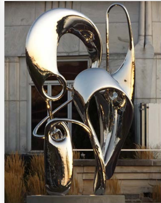
reflections , Guy J. Bellaver Volunteer Plaza, East Bank Riverwalk