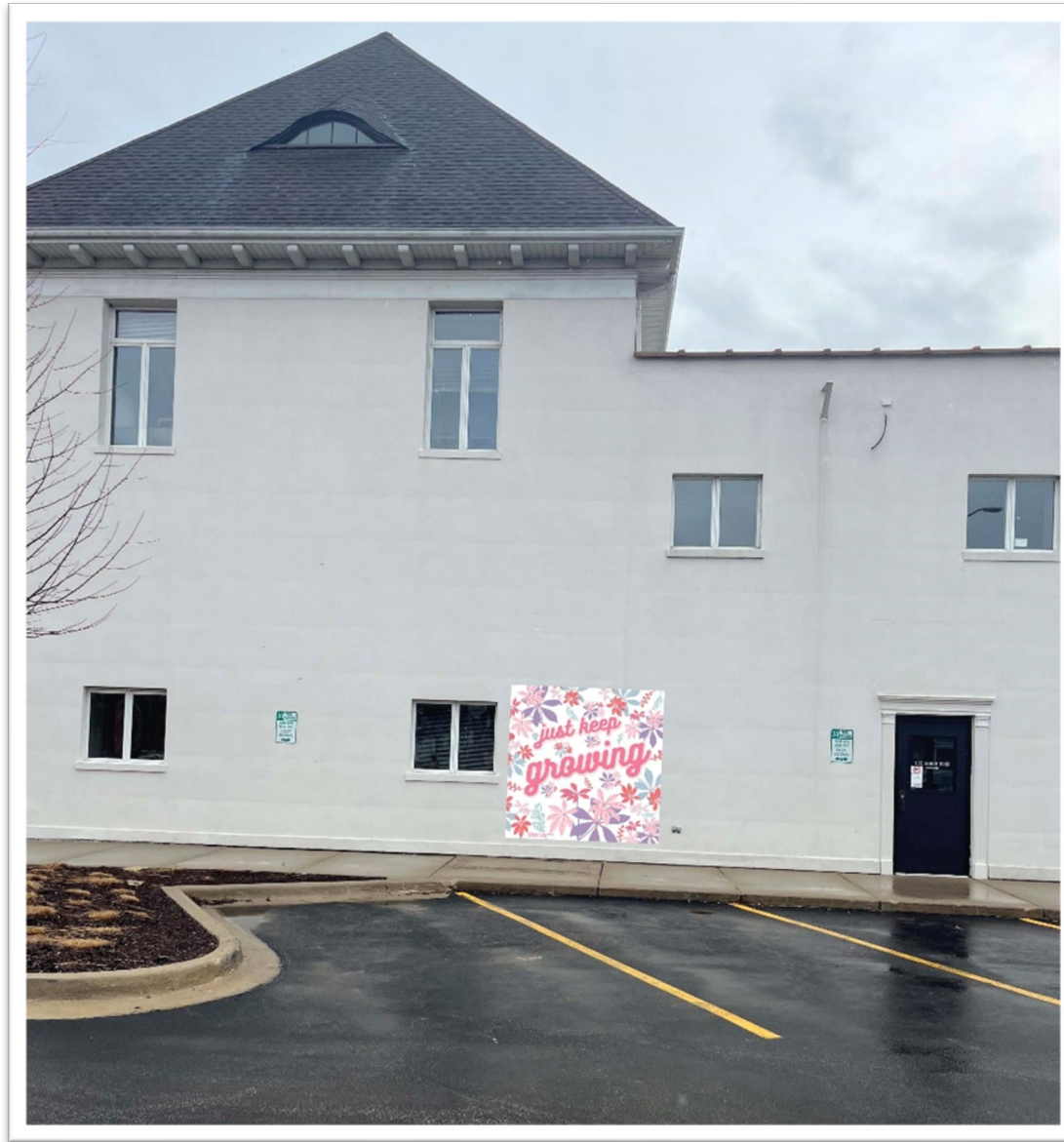
7 ft. x 7 ft. removable mural Placement on Building