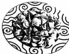
☞ MA PO TOFU