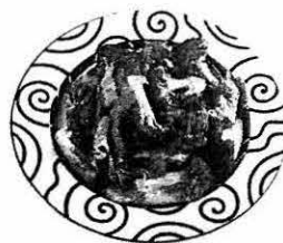
BEEF WITH BROCCOLI