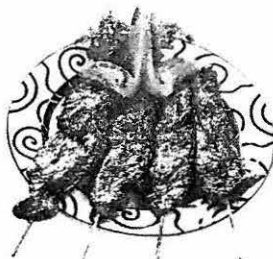
• BEEF KABOBS