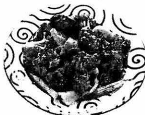
☞ GENERAL TSO'S CHICKEN