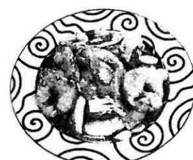
HONG SUE SHRIMP