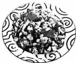
☞ KUNG BAO CHICKEN