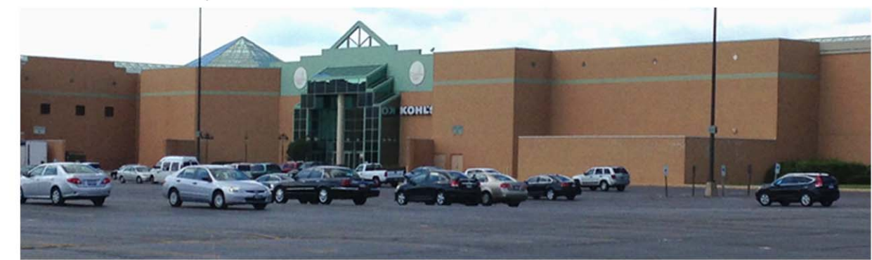
Existing Mall Facade "Draft not for Public Dissemination"