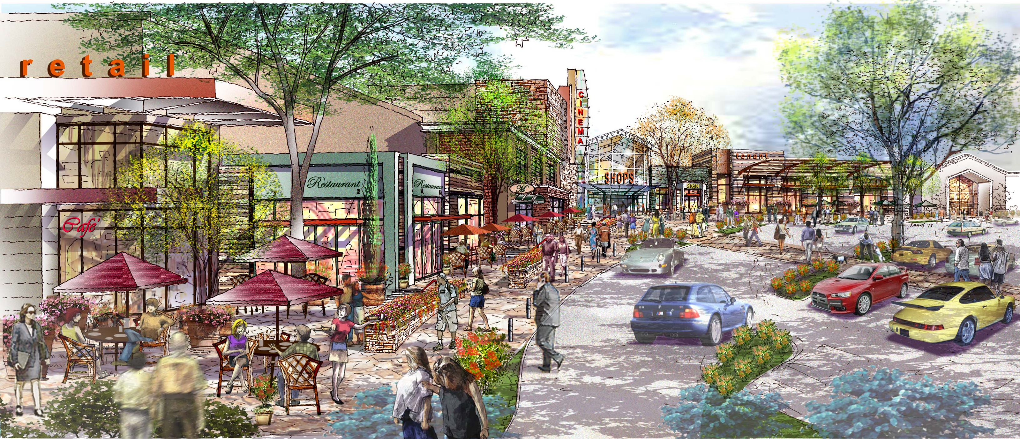
View of the New Mall Entry with Cinema beyond August 21, 2013