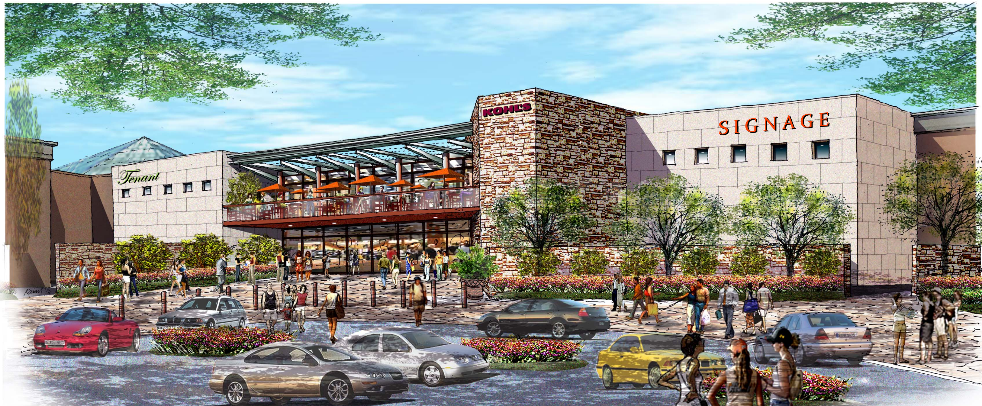
View of the New Mall Entry with The Food Court at the Upper Level August 30, 2013