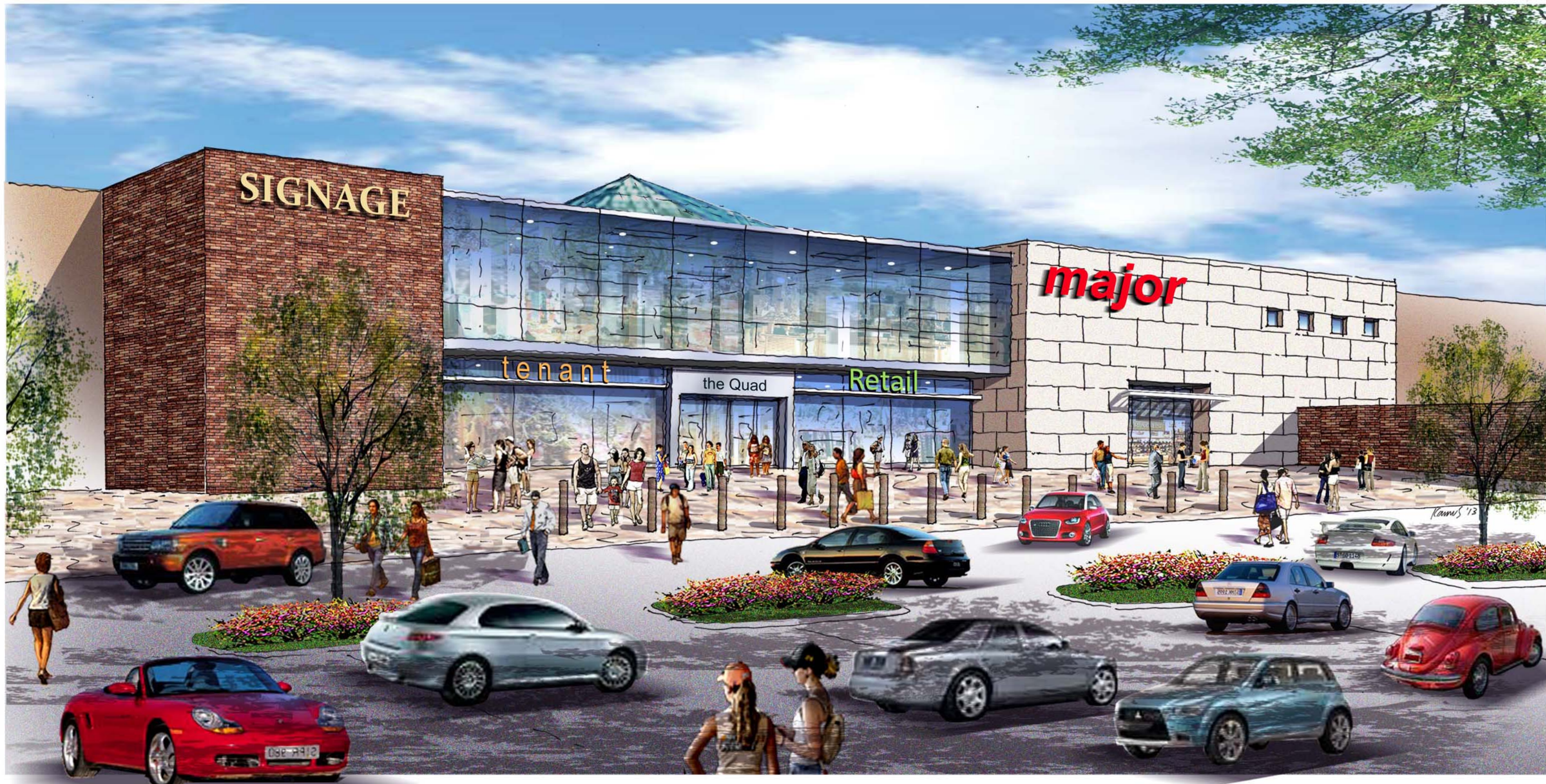
View of the New Northside Entry at the Lower Level