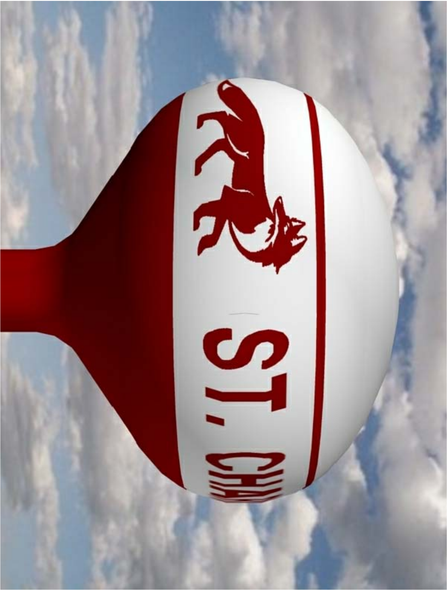
OPTION 1 - SIDE VIEW