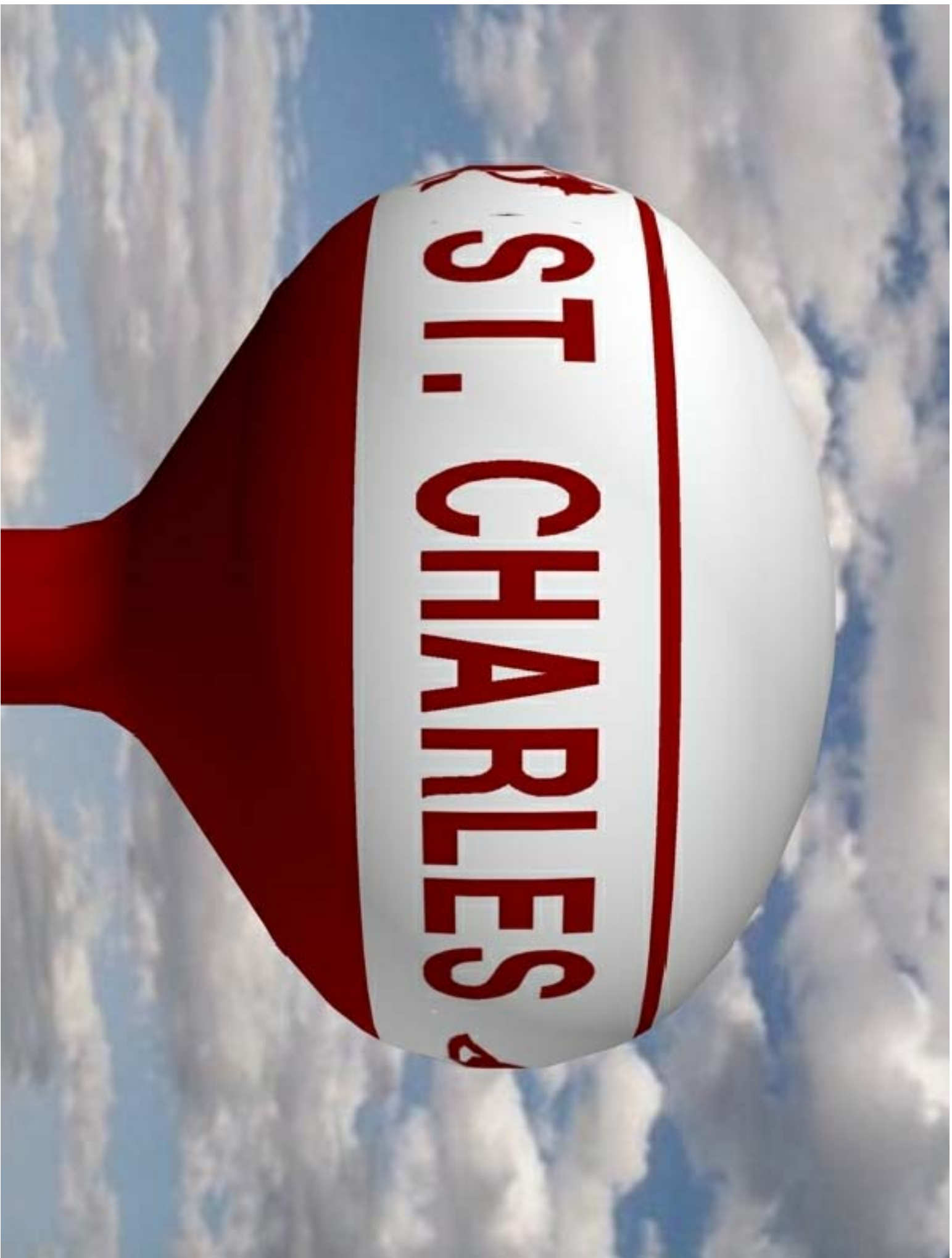
OPTION 1 - FRONT VIEW