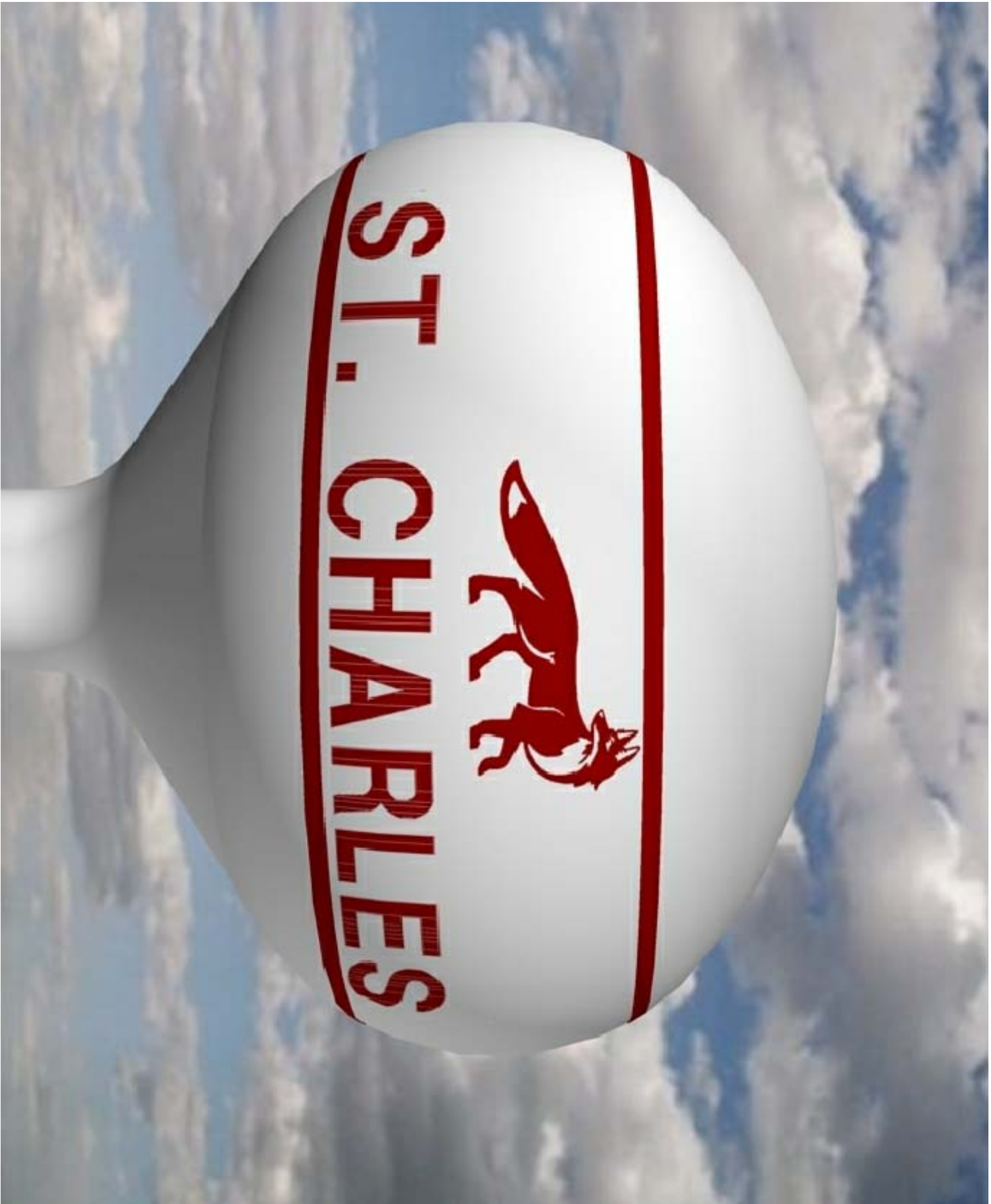
OPTION 2 - FRONT VIEW