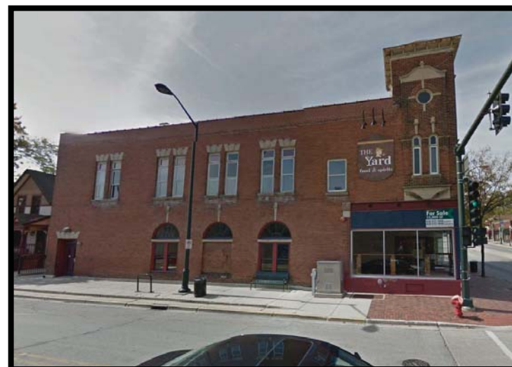
A FRONT ELEVATION (Existing) NO SCALE