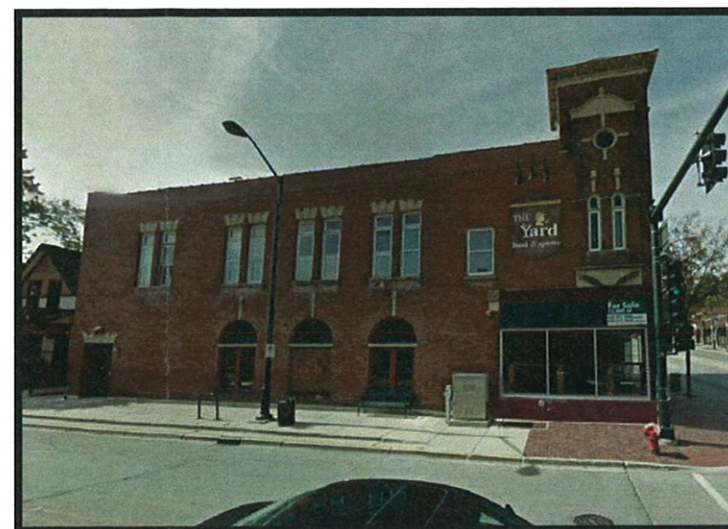
B FRONT ELEVATION (Existing) NO SCALE