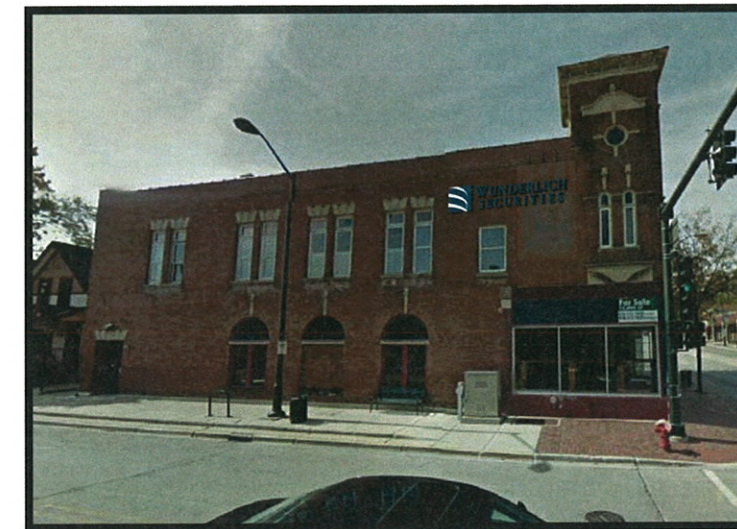
C FRONT ELEVATION (Proposed) NO SCALE